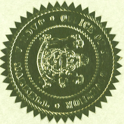
Jack Markell Jack A. Markell Governor

in the State of Delaware, and urge all citizens to appreciate and learn more about the African Immigrant cultural heritage that is so important to the First State.