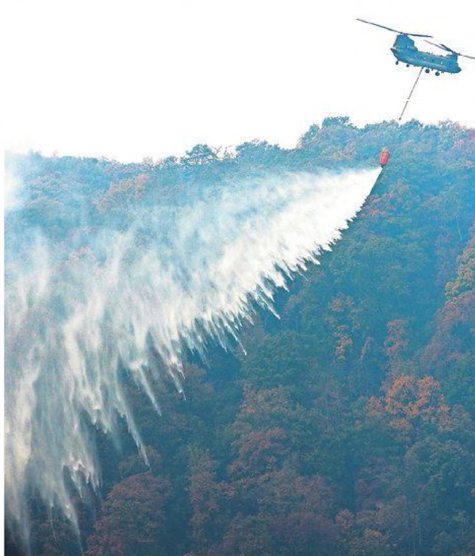
A South Carolina National Guard Chinook helicopter drops 2,000 gallons of water on the Pinnacle Mountain fire on Monday.

USA TODAY OBAMA: TRUMP WON, ACCEPT IT PAGE 1B