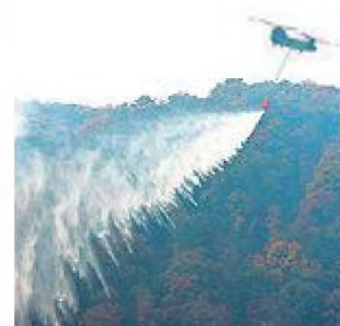
A South Carolina National Guard Chinook drops 2,000 gallons of water on the fire at Parris Mountain State Park on Monday.