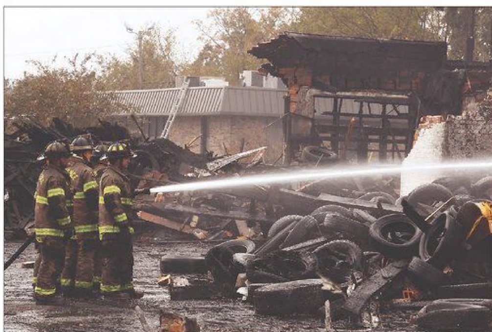
The old Heafner Tire Warehouse on South Irbey Street in Florence caught fire in the early morning hours of Monday.

The group responsible for development has yet to be named. Officials said the brewery will be located at 121 and 123 North Dargatzis Street. That's a part of the Kress Center revitalization project.