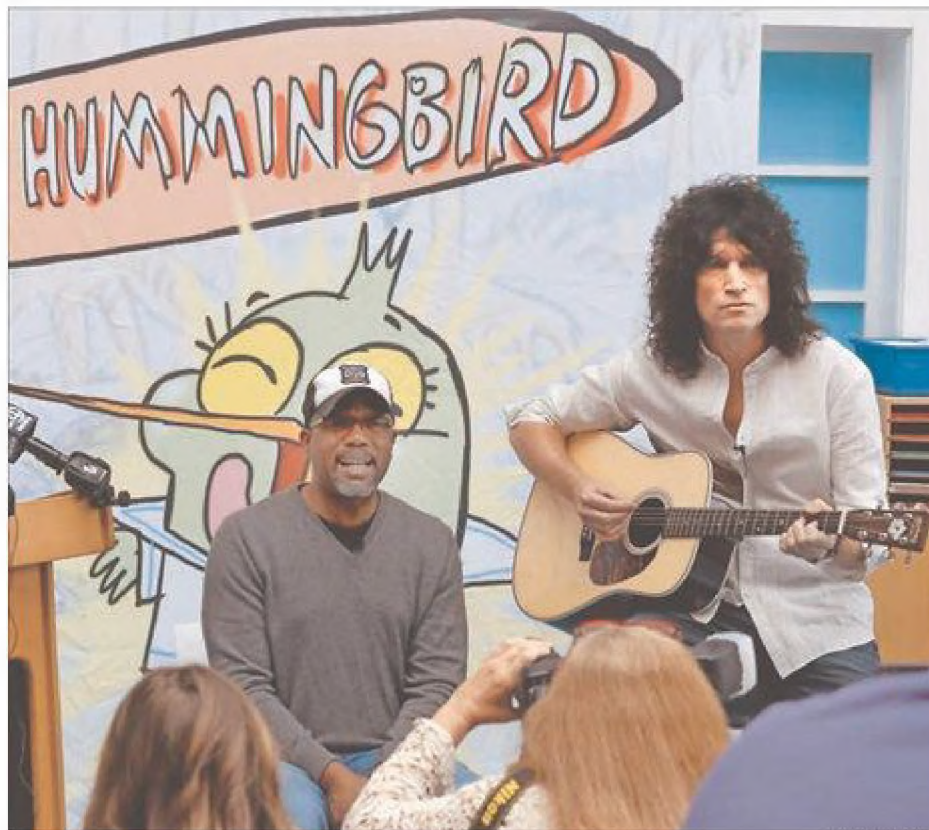
Darius Rucker (left) and KISS guitarist Tommy Thayer perform a song Monday from the new children's storybook app "Ernest Hummingbird" for patients and parents at MUSC Children's Hospital.

Music superstars unveil app to benefit Children's Miracle Network