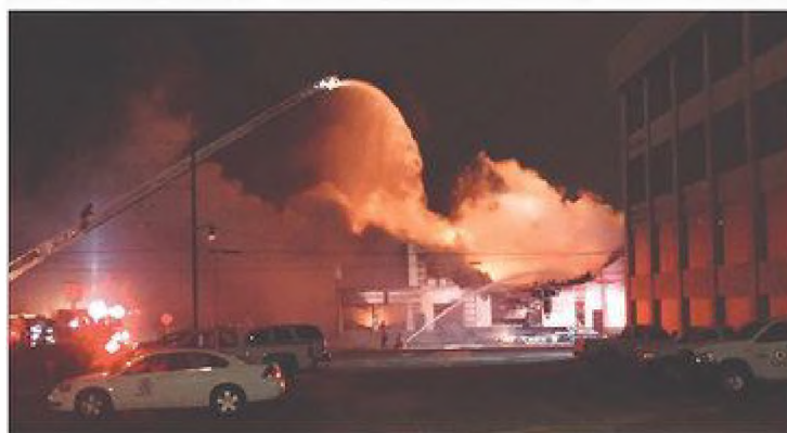
Smoke rises as firefighters pour water on flames coming from the old Heafner Tire fire.

BY JOSHUA LELOYD Morning News jleloyd@florencenews.com