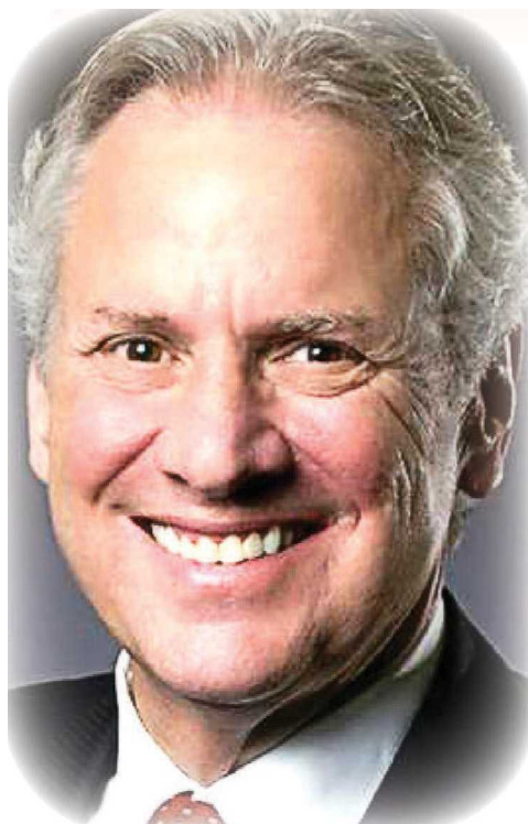
LT. GOV. HENRY McMASTER future US attorney general?