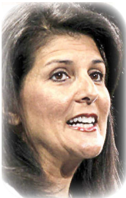
GOV. NIKKI HALEY future secretary of state?