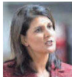
Gov. Nikki Haley

"Morning Joe" host Joe Scarborough tweeted Wednesday afternoon that Gov. Nikki Haley may be under consideration for a post in President-elect Donald Trump's cabinet.