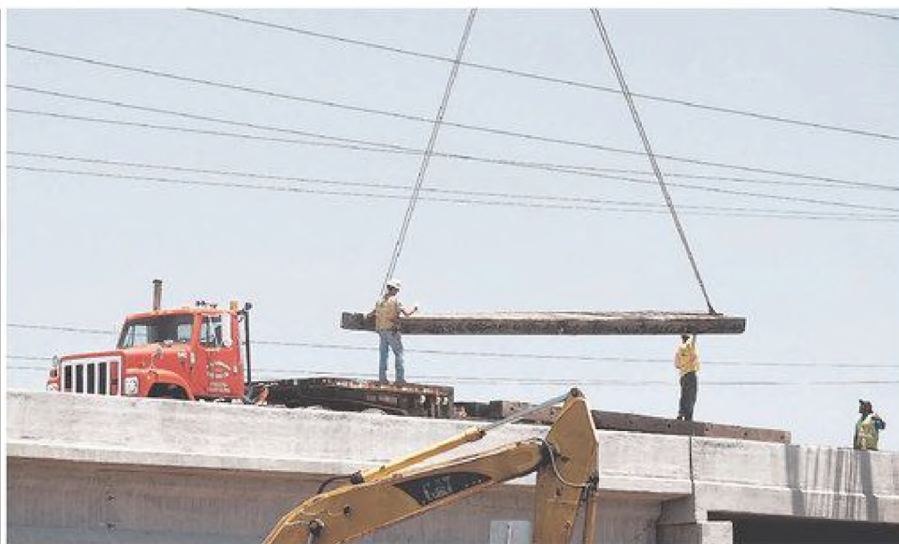
Workers with R. B. Dawson Bridge Co. help to guide crane mats, big pieces of wood that allow cranes and vehicles to drive on a marsh, onto a truck on Monday on the westbound ramp of the Bluffton Parkway flyover. The workers are cleaning up their equipment in preparation for the flyover to open.