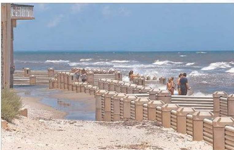
People walk on Monday around wave-dissipation devices in front of Ocean Club Villas and Seacape Villas in Wild Dunes on the Isle of Palms. The experimental devices must be taken down by July 28 because of potential impact on sea turtle nesting.

State orders erosion-control devices down because they may impact nesting