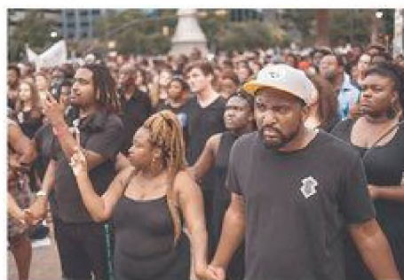
People hold a moment of silence at the State House before Sday's march.