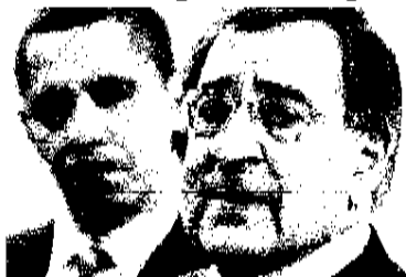
Panetta...honored for killing a dead

Hell, I always liked the guy though he was a brainless hack. This is the guy who armed the Baathists, set up ISIS, built the Sunni militias then went to Afghanistan and got the drug business operating like clockwork. Who could hate a man like that?