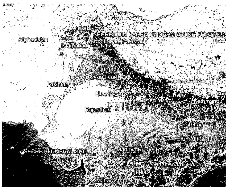
The "Secret" cross continental helicopter journey to dispose of an imaginary corpse