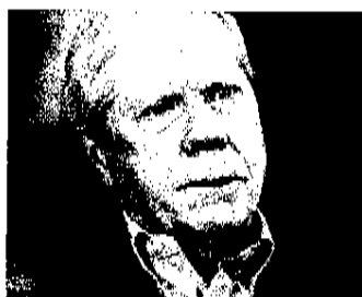
Paul Craig Roberts