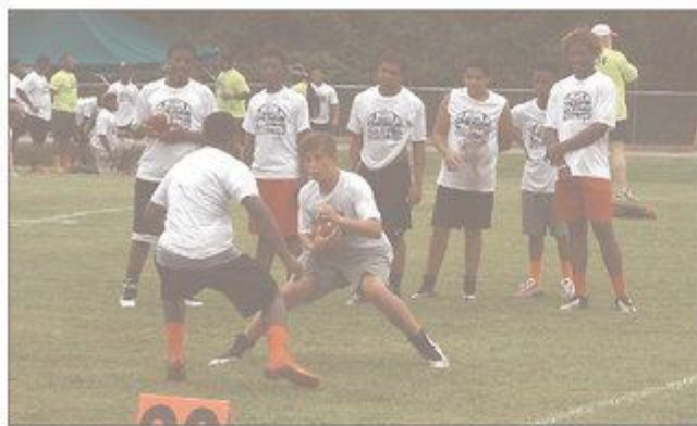
Above, participants practice their skills at the football camp held last Saturday.