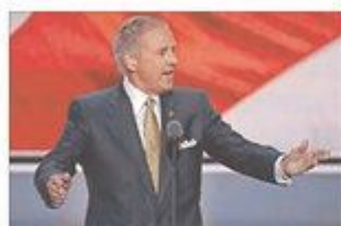
S.C. Lt. Gov. Henry McMaster nominates Donald Trump as the Republican candidate for president Tuesday in Cleveland.