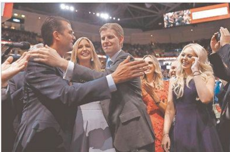
Republican presidential candidate Donald Trump's children (from left) Donald Trump Jr., Ivanka Trump, Eric Trump and Tiffany Trump celebrate Tuesday during the second day of the Republican National Convention in Cleveland.

Trump, Republicans celebrate long, bumpy road to nomination, bash Clinton