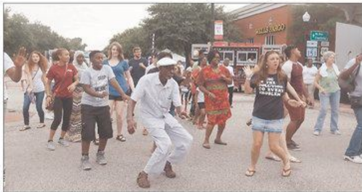
Hartsvillians celebrate in the streets their All-America City status on Friday night.

In celebration of the city of Hartsville's All-America City recognition, a downtown Block Party was held Friday evening with free hot dogs and drinks and T-shirts to the first 100 residents.