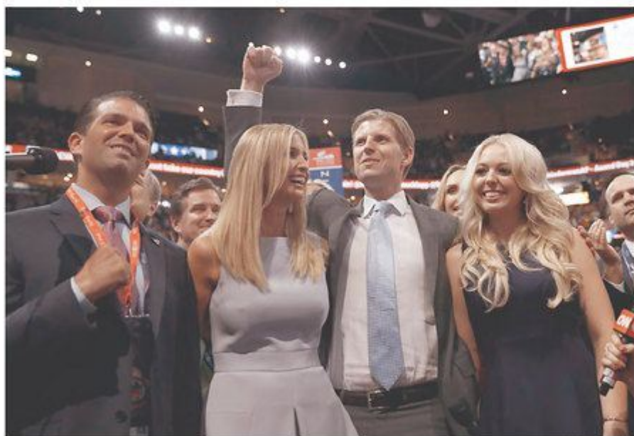
Republican presidential candidate Donald Trump's children – Donald Trump, Jr., Ivanka Trump, Eric Trump and Tiffany Trump – celebrate on the convention floor Tuesday during the second-day session of the Republican National Convention.