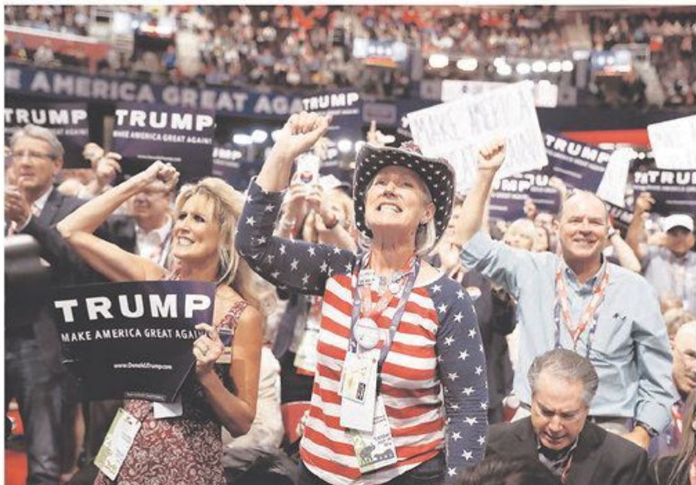
California delegates cheer during the nomination roll call on Tuesday, the second day of the Republican National Convention in Cleveland.