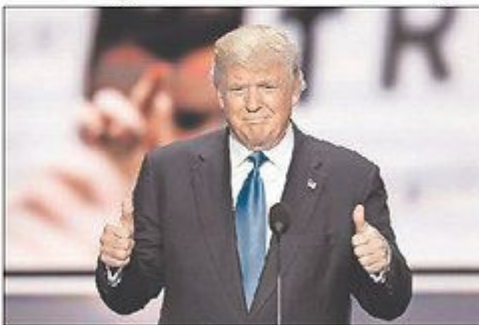
Donald Trump flash two thumbs up Monday during the opening day of the Republican National Convention in Cleveland. On Tuesday, Republicans nominated Trump as their presidential candidate.