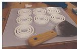
A project waits to be removed from a 3-D printer plate.

A 2006 Honda Accord was traveling head-on toward the pickup truck, and because of another oncoming car, the Accord swerved onto the right side of the road in order to avoid a collision, Collins said. That