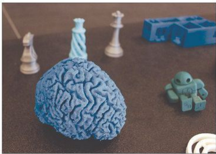
Several of the items on display in the Makerspace include a brain and chess pieces, all with the intricate design of pieces built traditionally.

BY MELISSA ROLLINS Morning News mrollins@florencenews.com