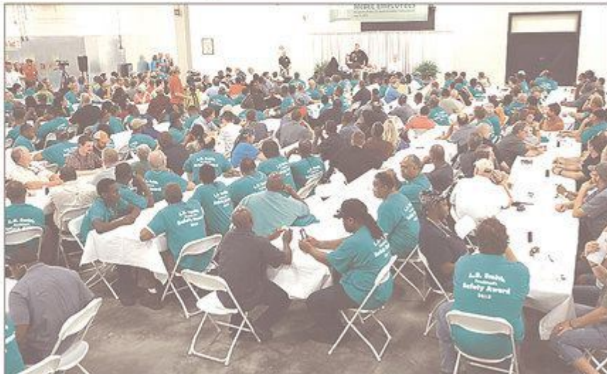
A.O. Smith recently earned the Lloyd B. Smith President's Safety award for 2015.