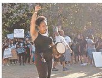
Crowds gathered Wednesday at Marion Square in downtown Charleston for a rally against police violence.