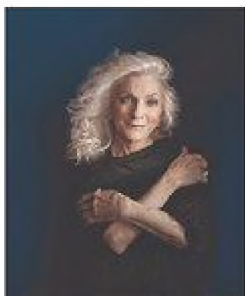
Judy Collins will perform with Ari Hest July 21 at the Francis Marion University Performing Arts Center.