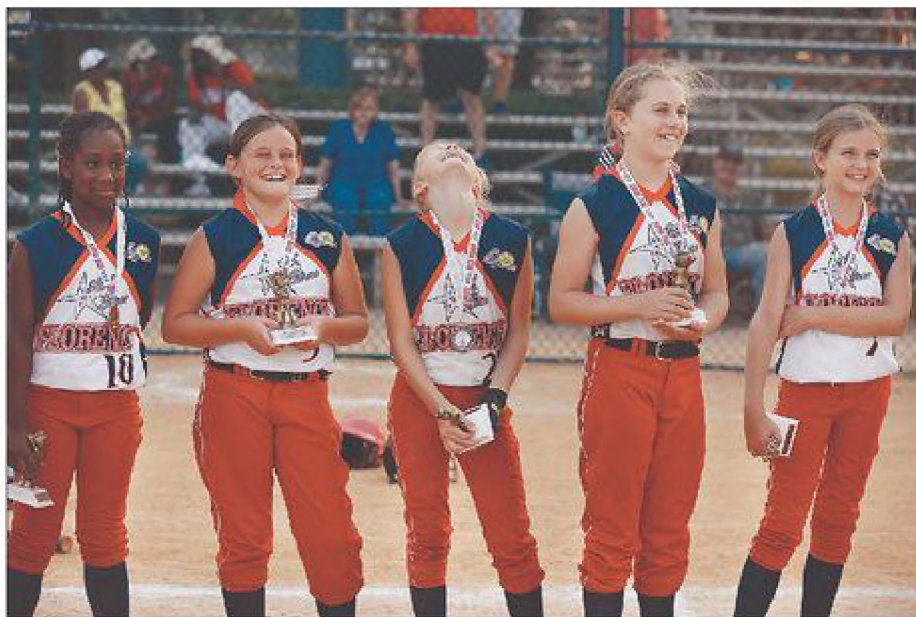
Members of the Florence Angels softball team laugh as their teammates receive their awards for placing second in state after the game against Aynor on Wednesday.