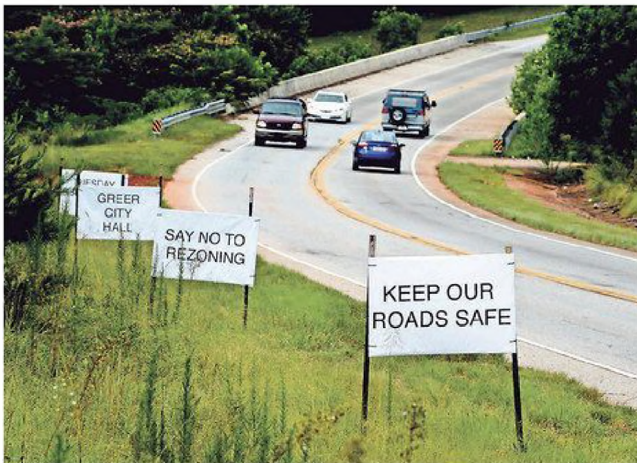
Cars drive past anti-rezoning signs along Brushy Creek Road.