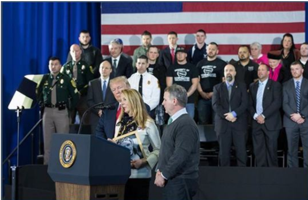
President Trump delivers remarks on the Opioid Crisis / March 19, 2018