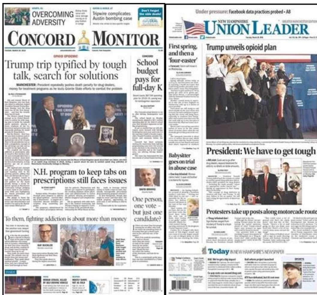
Coverage in New Hampshire Papers