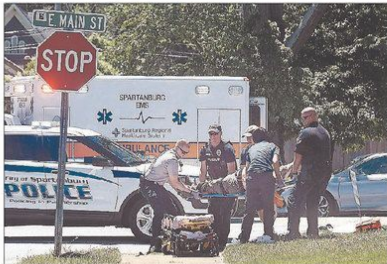
Police said a case of road rage near downtown Spartanburg led to a man being shot in the middle of East Main Street on Wednesday afternoon. The person who was shot has been hospitalized.

Pacolet man arrested, charged with attempted murder