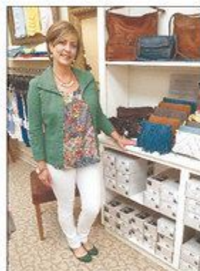
Ford stands next to the purse that

In the video, the purse was seen to have