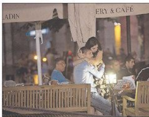
People console each other near the scene of a shooting attack Wednesday in Tel Aviv, Israel.

Tel Aviv's Ichilov Hospital said the four slain Israelis had been brought to the facility in critical condition and later died of their wounds.