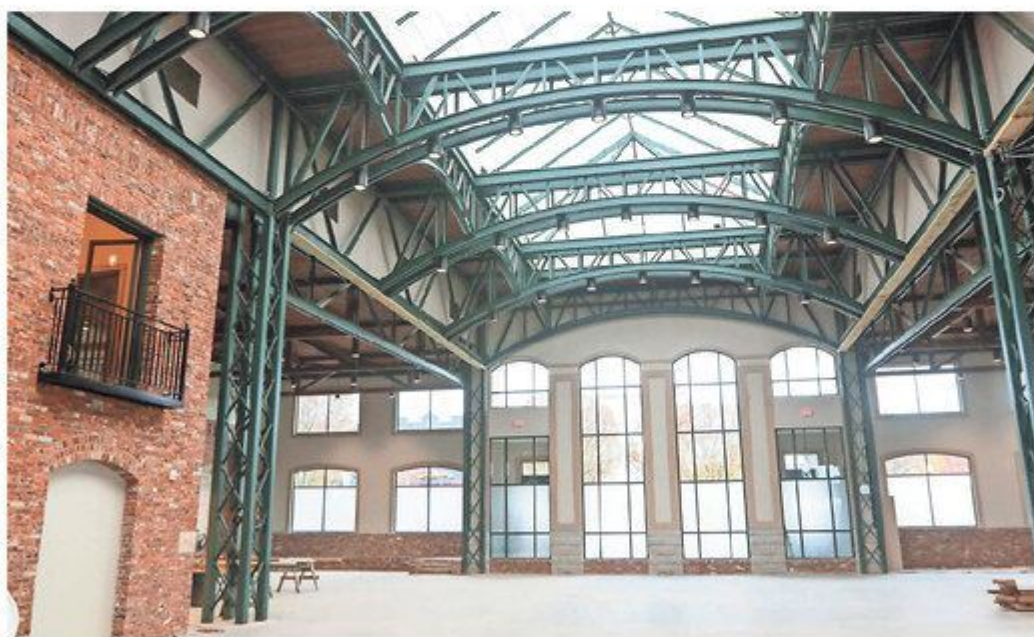
The $2.6 million Bleckley Station in downtown Anderson (above and below) plans to host its first event on Jan. 3.