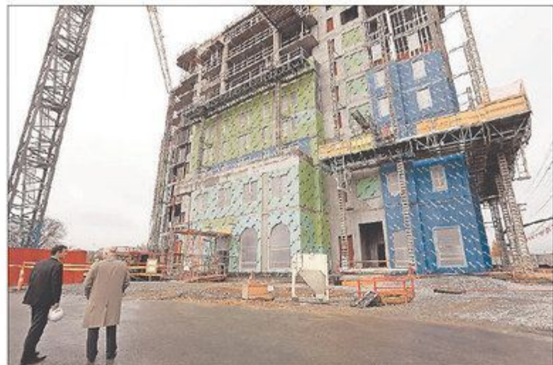
A topping-out ceremony at the 10-story AC Hotel by Marriott in downtown Spartanburg was held Monday.