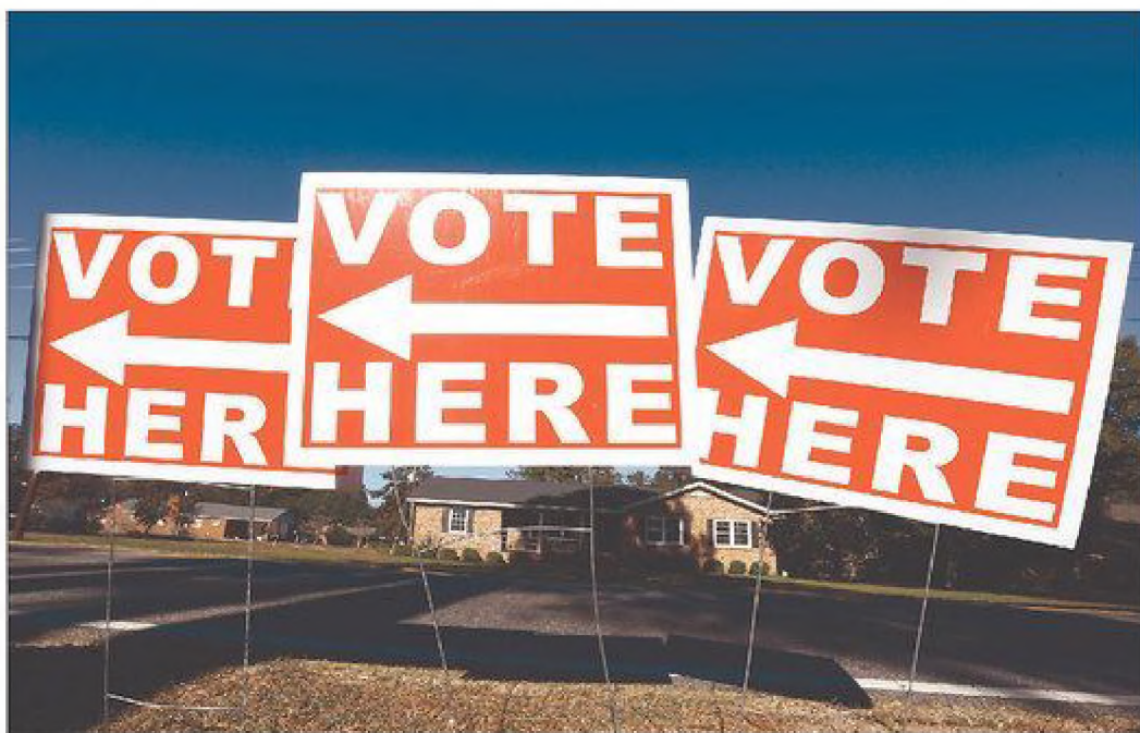
"Vote Here" signs can be seen across the Pee Dee today just outside of polling places. These signs sat outside Florence Ward 14 at Sandhurst Church on Monday afternoon.