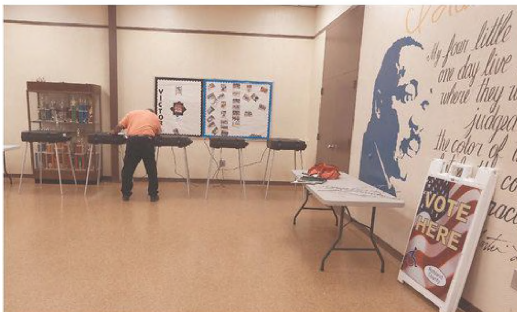
A precinct technician sets up voting machines at MLK Park in Columbia.

Is it Trump? Is it Clinton? Either way, you'll be OK, experts say