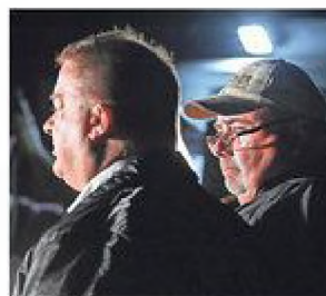
Investigators believe they have found all the bodies buried on Todd Kohlhepp's 95-acre property. Seven deaths have been tied to the case.