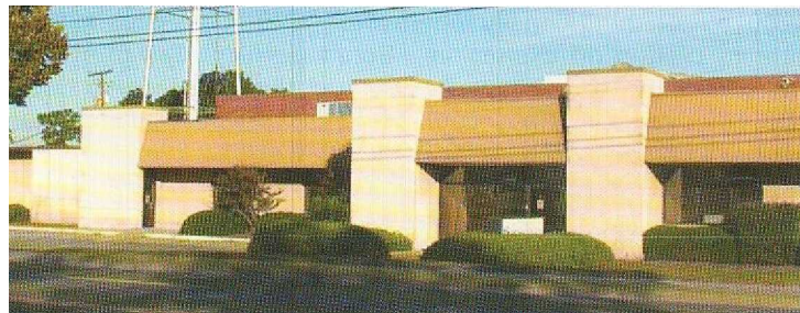
JGBR has purchased the former Asten Johnson facility in Walterboro.