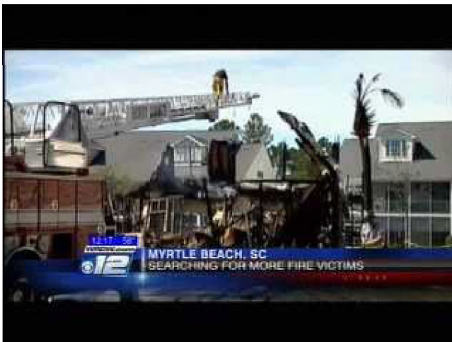
WRDW (CBS)3/18/2013 12:17:58 PM Augusta, GA News 12 Midday

for an egg-citing easter egg hunt at the mansion. this afternoon governor nikki haley and the first family are hosting children who have been treated at palmetto richland during the past year. the hunt will be held today at 4:30pm. we're just hours away from the premiere of the brand new season of "dancing with the stars"... it kicks off tonight at 8pm right here on abc columbia. and reigning " dancing with the stars" champ melissa rycroft went inside the very last rehearsals before tonight's premiere. and next up in our