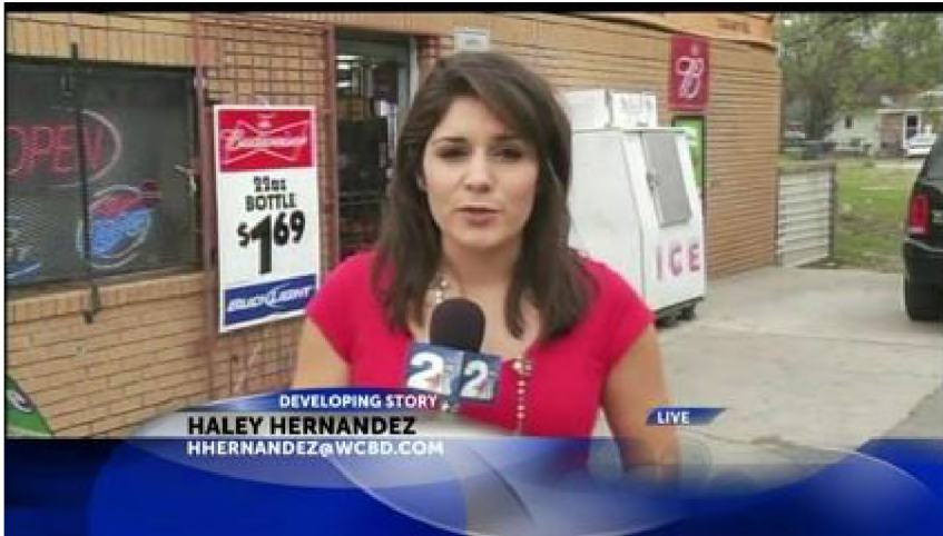
WCBD-CHS (NBC)3/18/2013 5:01:09 PM Charleston, SC WCBD 5PM News

that federal law trumps state law. indeed. to understand, just how popular these laws are with conservatives, watch how the crowd at cpac responded to south carolina governor nikki haley when she mentioned her own state's voter fraud law. >> every election in our state now requires photo i.d. before you vote. >> joining us now is democratic congressman elijah cummings of maryland. welcome, sir. >> it's good to be with you. >> what is your response, sir,