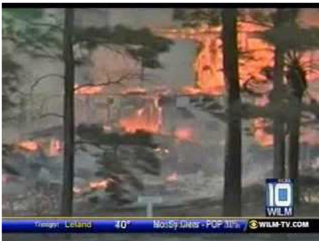
WILM (CBS)3/19/2013 6:18:22 AM Wilmington, NC WRAL Morning News

out there today. however, the investigation at this point has reached a bit of a plateau. without any new evidence.. getting down to what cause the blaze it will be difficult. meanwhile...south carolina governor nikki haley commending the work of emergency workers for their response to the fire that consumed hundreds of homes in a condominium complex. the governor took an aerial tour of the damage yesterday. i want to tell the victims that i am so sorry, 'cause while you see these structures are down, you don't see the pictures and the emotional things that can't be replaced. and that's where my hearts breaks, i am... we are unbelievably blessed, the fire began saturday next to power lines in