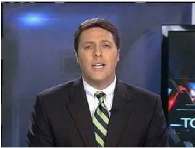
Greenville, SC Fox Carolina Ten O'Clock News