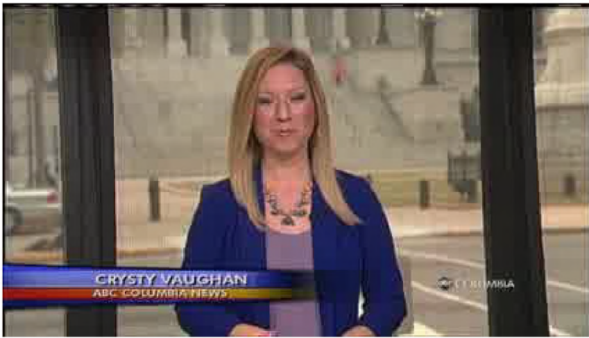
WOLO- COL (ABC)3/18/2013 12:12:28 PM Columbia, SC ABC Columbia News at Noon

Local Viewership: 3,685 Local Publicity Value: $121.66