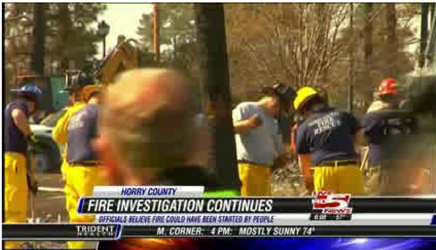
Charleston, SC Live 5 News at 6a