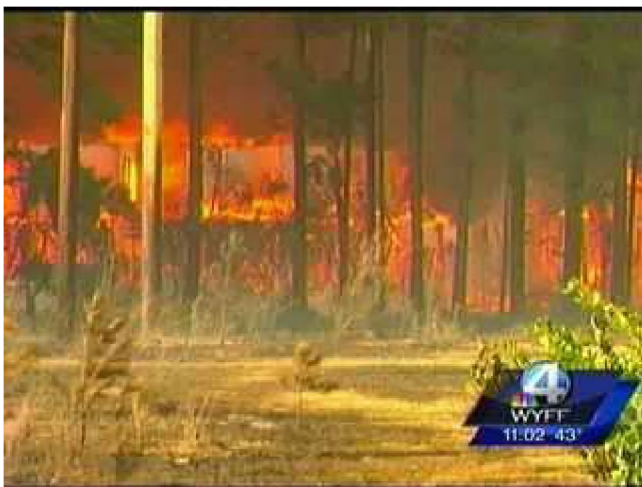
WYFF (NBC)3/18/2013 11:02:50 PM Greenville, SC WYFF News 4 @ 11pm

crime-sc.coming up later in the newscast...we'll also have an update on a case out of laurens county.. where threatening letters have been sent. we are covering the carolinas tonight. ... governor nikki haley has ordered flags to be lowered to half-staff in south carolina... in honor of a fallen midlands army veteran. veteran.this is a look at flags in greenville... lowered in honor of a woman...who made the ultimate sacrifice while serving our country in afghanistan. officials say inez baker, who goes by renee..was killed earlier this month...after an attack at a u-s base..by three men wearing afghan army uniforms.she's a 26 year army veteran...who served six tours