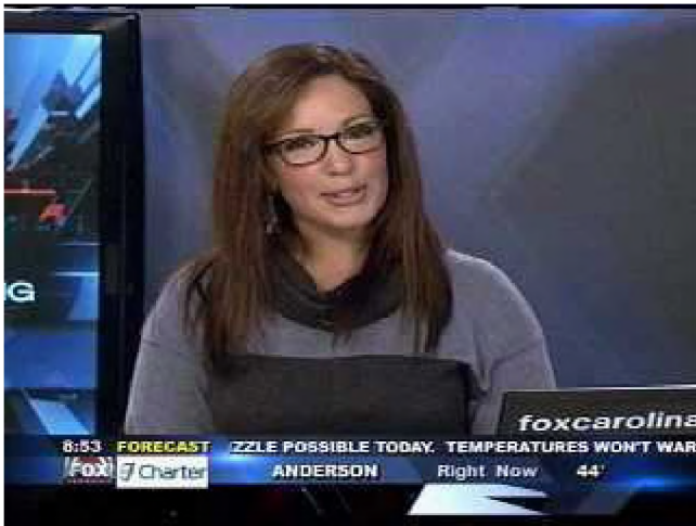
WHNS (FOX)3/18/2013 8:53:51 AM Greenville, SC Morning News @ 8

update. [3]haley in chas new this morning, governor nikki haley heading to the lowcountry with commerce on her mind. the governor's first stop will be at charleston place hotel where she'll speak at the industrial asset management council conference. from there it's up to ladson where the governor will attend a company ribbon cutting [4]x factor do you have that x-factor? now is the time to find out. open call auditions for season three of the show have arrived in north charleston. expect the coliseum area to be packed for the first round tomorrow. wristband distributions started sunday and