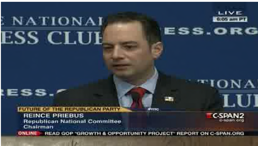
CSPAN23/18/2013 9:05:40 AM U.S. Cable

changing its name.this morning, the hospital will unveil the new logo for the "greenville health system." south carolina's first family is hosting their annual easter egg hunt today. today.governor nikki haley and her family are hosting the hunt at the governor's mansion. children ages three through 10 who were admitted to the palmetto health children's hospital have been invited to attend with their families.the hunt starts at 4-30 p-m. ((adlibs)) ((adlibs)) hold 3 hold