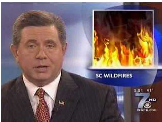
WSPA (CBS)3/18/2013 5:01:16 PM Greenville, SC 7 On Your Side at 5pm

surveillance footage but they won't let me take a look yet because they say this is all still part of the ongoing investigation. reporting live from north charleston. i'm haley hernandez. news2. >> and police tell us the suspect was wearing a blood hoody and -- jeans and had a dread lock hairstyle. >>> our big story tonight, wildfires across the state. the state forestry commission reportedly at one point this weekend more than 60 burning fires. a massive fire some myrtle beach