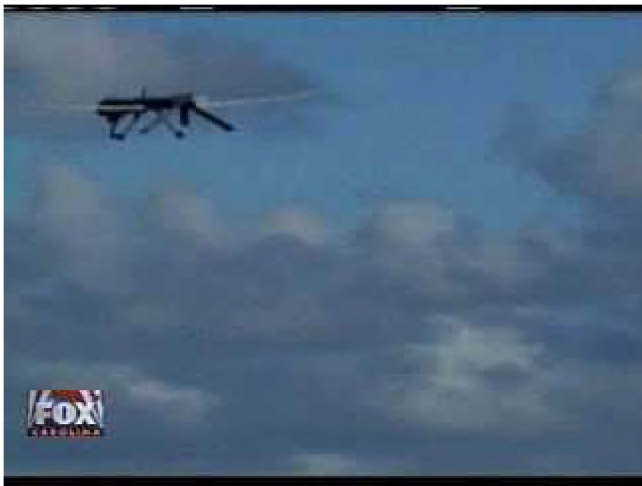
Greenville, SC Fox Carolina Ten O'Clock News