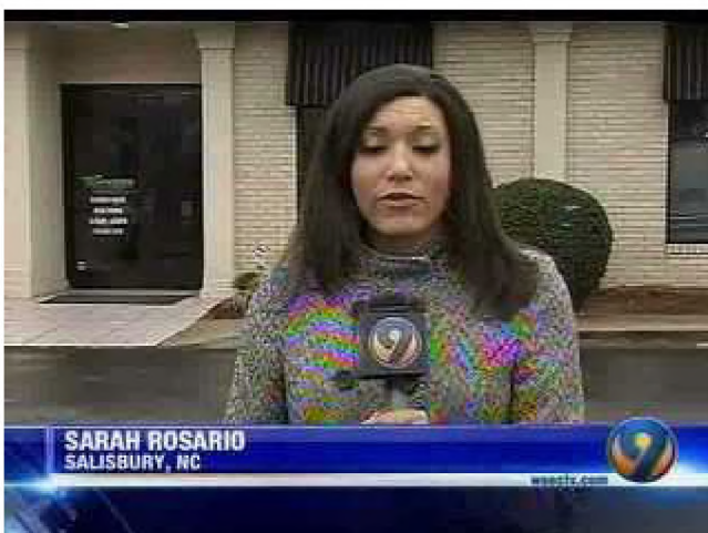
WSOC-CLT (ABC)3/18/2013 12:31:42 PM Charlotte, NC Eyewitness News Midday Hour

see the damage.investigators are still trying to find out where and how the original grass woods fire began. the blaze blew through as winds and low humidity fed the fire. governor nikki haley and state and local emergency officials will be conducting a briefing at windsor green at 2:45 today. a scary time at a florida college this morning... after a man is found dead. dead.investigators at the university of central florida in orlando said they found explosive devices... and an assault weapon during a search. it started with what police are calling an apparent suicide in a dorm room.close to 500 students had to be evacuated from the building.