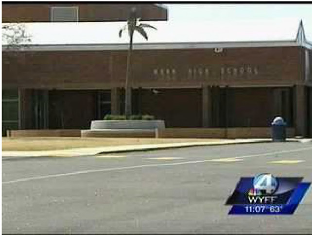
WYFF (NBC) 3/15/2013 11:07:38 PM Greenville, SC

legislation will protect people's privacy. the bill does allow exceptions in cases where drones could reduce danger to the public or criminal suspects. south carolina governor nikki haley has appointed members to a group to review state regulations and make recommendations for change. change. the 11-member group is made up of officials from both parties from across the state-- including representative eric bedingfield of mauldin. the group will hold its first meeting next month. it has until mid-november to issue its report to the legislature. a town in western north carolina will serve as the backdrop for a television pilot-- based on the classic washington irving book "the legend of sleepy hollow." hollow." in the show, the town