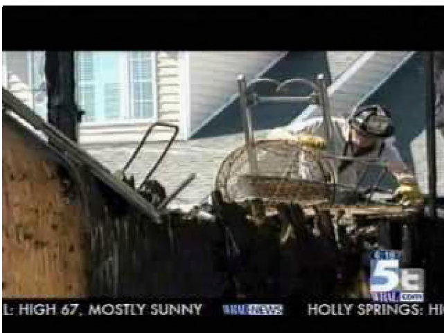
WRAL-RAL (CBS)3/19/2013 6:18:33 AM Raleigh, NC WRAL Morning News

the fire destroyed 109 unit ins two dozen--units in two dozen building the gov. nikki haley praised e. coli more wren sire responders. >>> our area is prone to wild firers because of the development. so this that is what--so that is when i was thinking it was. >>> well, we are going to dry out quickly this afternoon so we have a high fire danger here as well. our temperatures are going the drop at the end of the week.