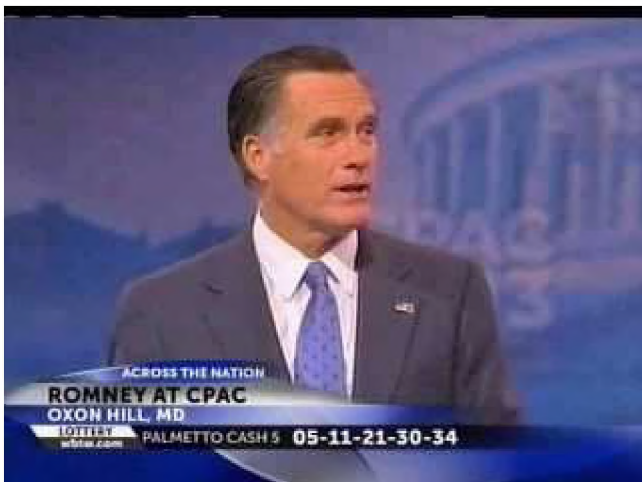
WBTW (CBS) 3/15/2013 11:15:11 PM Myrtle Beach, SC

district officials say only bus riders had gotten to the school before classes were cancelled. officials say the bus drivers returned students.. and made sure a parent or guardian was home. [a22] haley romney cpac-svo governor nikki haley was in the spotlight today.. at the "conservative political action conference in maryland... known as c-pac. we're told haley was not planning to attend ... until mitt romney asked her to introduce him. haley supported romney in his presidential bid.. stumping for him in battleground states. "there is something very special when you see a leader and a leader fights for what they believe in and a leader fights to prove and make a difference in the country and a leader fights and goes through what's a challenging race and it doesn't go our way. what makes a true servant leader is