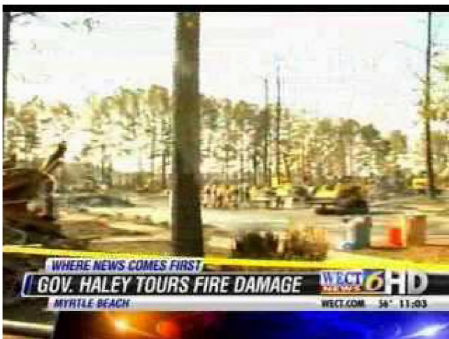
WECT (NBC)3/18/2013 11:03:37 PM Wilmington, NC WECT News at 11

the area where the fire started was trampled over by dozens of emergency personnel.. so they likely will never know if the fire was started by accident or intentionally. governor nikki haley toured the damage today.. and said it's a miracle no one died. "we can't stop the winds. we can't stop the fact that this fire started. but the fact that we stop anybody from being hurt -- and that people were actually pulling people out of homes -- i mean, you can't put a price on that." authorities did say dozens of pets died.. and officials have set aside their remains for their owners. a wildfire in pigeon forge tennessee has destroyed 30 large rental cabins. it started last night around 5. the fire is