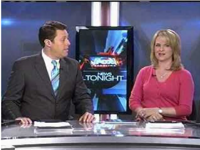
WHNS (FOX)3/20/2013 10:13:47 PM Greenville, SC Fox Carolina Ten O'Clock News

butts day g-r-u hosted a forum to explain to students why they are choosing to become a smoke free campus. at the