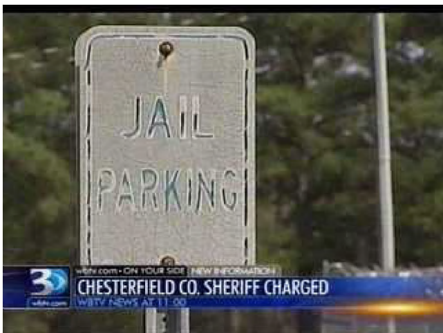
WBTV-CLT (CBS)3/20/2013 11:09:09 PM Charlotte, NC WBTV News 3 at 11PM