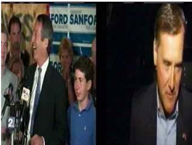
WHNS (FOX)3/20/2013 11:05:20 PM Greenville, SC FOX Carolina News Tonight

on the fox carolina money watch... governor nikki haley made a stop in the upstate today.. celebrating a new manufacturing facility... that's up and running tonight. tonight.the bosch rexroth facility in fountain inn ...is part of an 80-million expansion project...that will create 160 new jobs over the next five years.during today's ribbon cutting ceremony... governor haley said the state is excited for the facility...to start production. 3 "when you get a good quality company like this, that appreciates those who work for them...that tries to get the