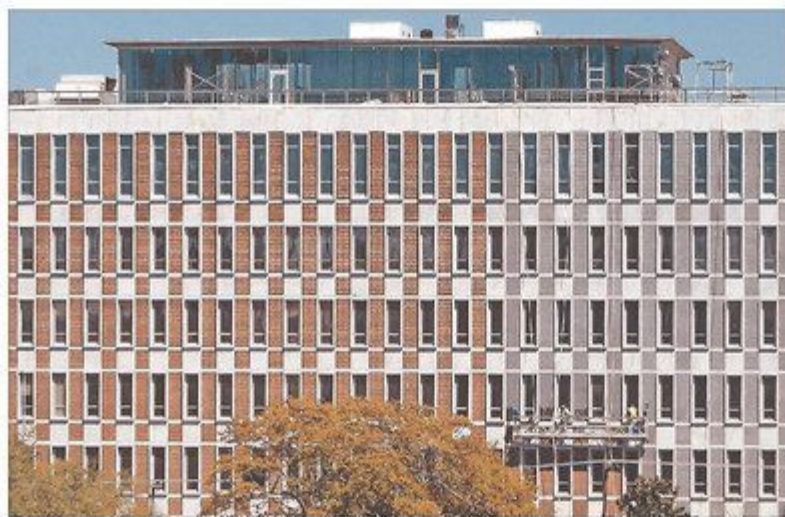
The Dewberry, a Meeting Street hotel, is expected to open soon across from Marion Square.

OK still needed for club and to hold Spoletto Soiree on Saturday