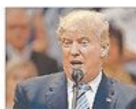
Donald Trump speaks to supporters Thursday in Billings, Montana.

The New York billionaire shrugged off signs of dissent within his own