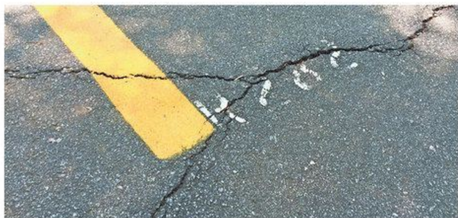
Greenville County will use a ceramic blanket to repair some cracks on Swamp Rabbit Trail.