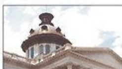
AT THE STATEHOUSE

But the chairman of the state Transportation Infrastructure Bank