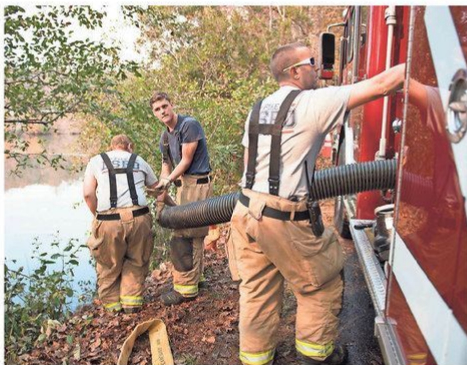
Firefighters fill a fire engine with water from Lake Oolenoy near Table Rock State Park on Thursday.

SURGEON GENERAL: ONE IN 7 OF US WILL SUFFER ADDICTION PAGE 1B