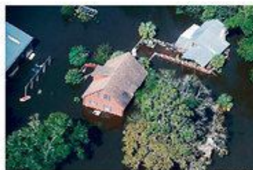
The Nation Ford High School football team took 70 people to Nichols last week to help the town clean up from devastating flooding that destroyed nearly all of its 261 homes in the aftermath of Hurricane Matthew.

'They've lost it all': Nation Ford team helps S.C. town clean up after Hurricane Matthew