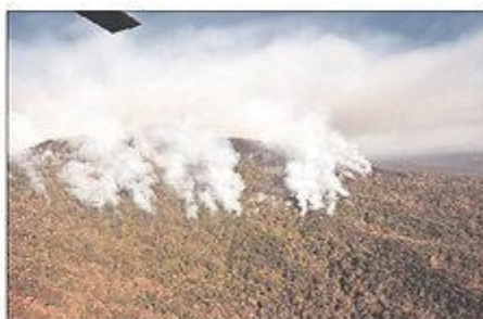
An aerial view of the Pinnacle Mountain fire in northern Pickens County.