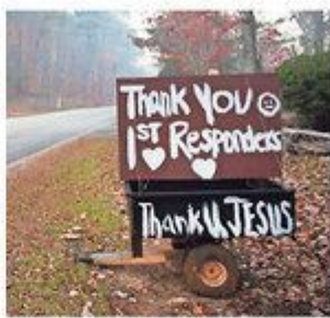
A sign outside of a home near the state park expresses gratitude.