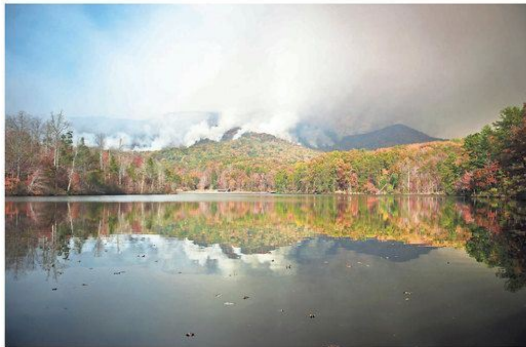
Smoke rises off Pinnacle Mountain as fire burns on Thursday.