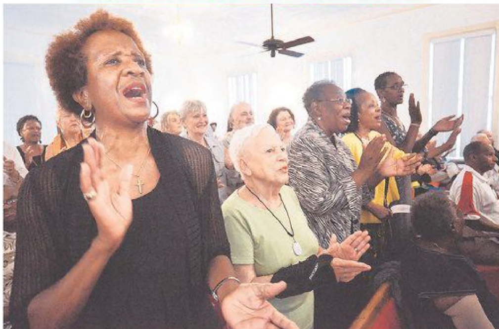
Members of the audience sing along to a hymn sung by the Sons of Allen Choir during Thursday's memorial service marking the one-year anniversary of the mass shooting at Charleston's Emanuel African Methodist Episcopal Church. Thursday's interfaith service, sponsored by the Unified Interfaith Community Coalition, was held at Beaufort's Grace Chapel AME Church in Beaufort.