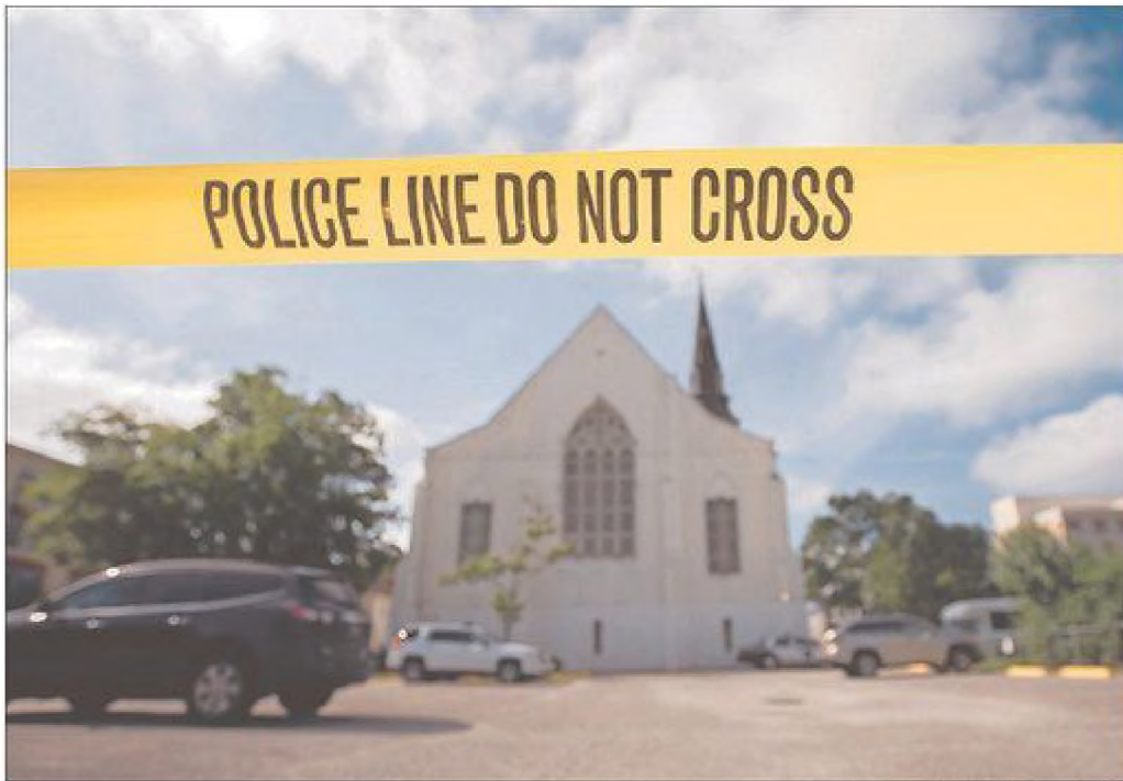
Police tape surrounds the parking lot behind the Emanuel AME Church as FBI forensic experts work the crime scene, where nine people were shot by Dylan Storm Roof, in Charleston. After nine black parishioners were slain at a Charleston church, South Carolina did what many thought would never happen: It moved the Confederate flag off Statehouse grounds.