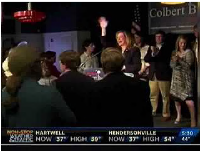
WYFF (NBC)3/20/2013 5:30:44 AM Greenville, SC WYFF News 4 @ 5:30am