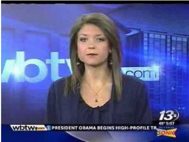
WBTW (CBS)3/20/2013 5:07:54 AM Myrtle Beach, SC News 13 First Morning