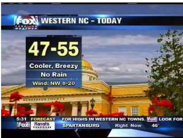
WHNS (FOX)3/20/2013 5:31:29 AM Greenville, SC Morning News @ 5

vote... busch will face the winner of the gop primary runoff in the may 7 general election. governor nikki haley will be in the upstate today as a manufacturing company is expanding. the governor will join more than 150 other guest for a ribbon cutting ceremony for bosch rexroth's newly expanded fountain inn hydraulics manufacturing plant. the project is a 80 million dollar investment and created about 160 new jobs. this morning's ceremony begins at 11:30. one person is dead this morning after a wreck in greenville county. the driver of a 2001