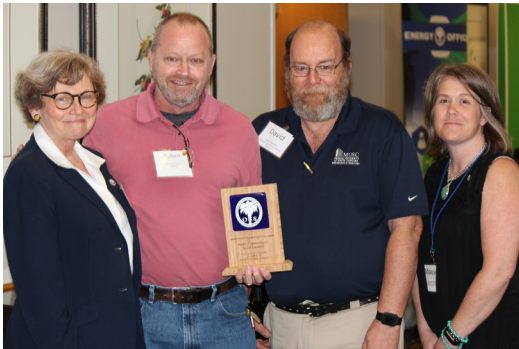
Medical University of South Carolina