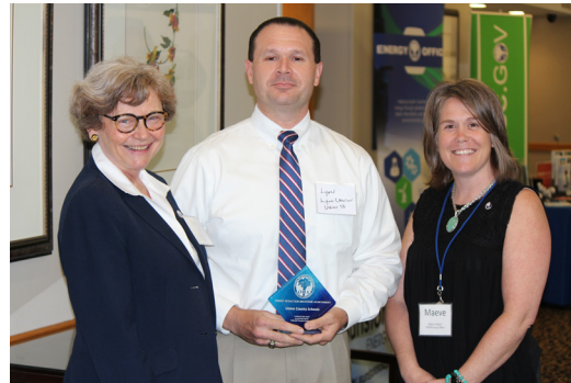
Union County School District