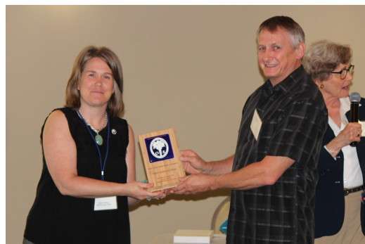
Trident Technical College