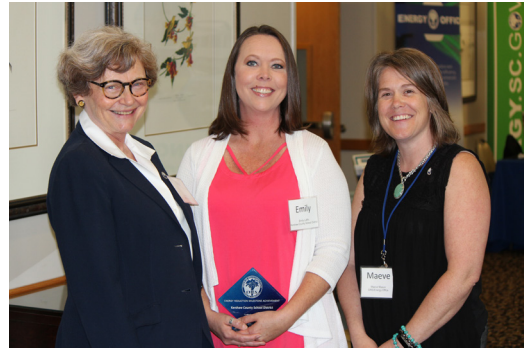
Kershaw County School District