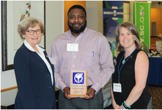
Lee County School District

The Energy Office provides tangible recognition for those public entities that have met their mandated 20 percent reduction in energy intensity since the year 2000.