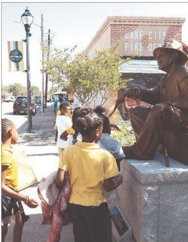
Students from Lake City's Early Childhood Center look at a sculpture of Huey Cooper during their ArtFields Jr. art walk this week in Lake City. Each student reached to rub Cooper's rabbit foot for good luck.