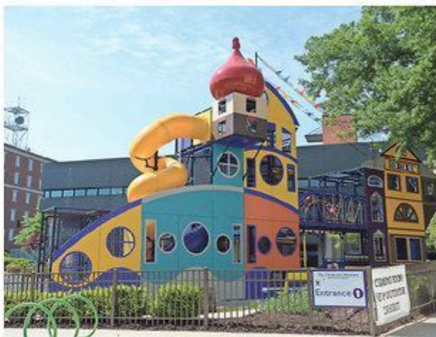
The newest addition to the Children's Museum of the Upstate will open April 30.