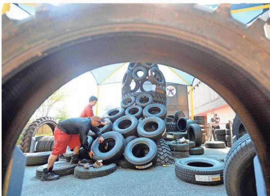
A tire play structure is assembled as part of an outdoor exhibit, called Bib's World.