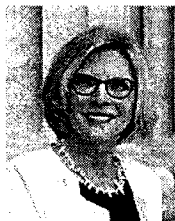
Senator Katrina Frye Shealy

Republican - Lexington District 23 - Lexington County - Map