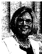
Senator Katrina Frye Shealy

Republican - Lexington District 23 - Lexington County - Map