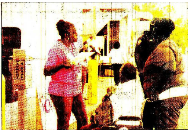
Marion County Department of Social Services staff are among the agencies helping visitors find assistance during the first Team South Carolina Hurricane Matthew relief event at the Marion County Administration Building.