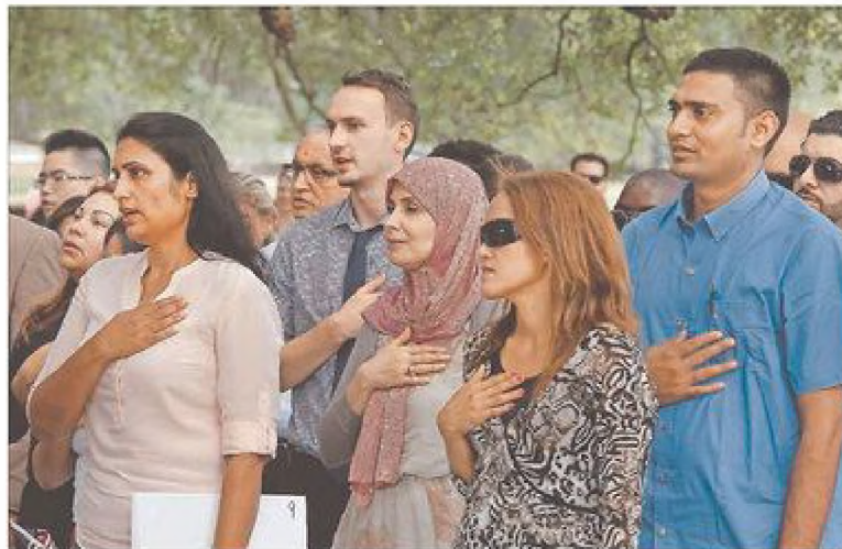
New United States citizens say the Pledge of Allegiance during a naturalization ceremony at Middleton Place on Monday morning. Fifty-three people took the oath of allegiance during the event.

Fifty-three from around globe become U.S. citizens in local ceremony