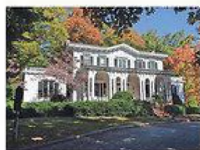
The sale of the historic Beattie House, in negotiations for more than a year, is off.