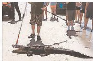
A photo captured by an onlooker shows an alligator after it was pulled from the surf at Sullivan Island on Monday.

He monitored the capture, though the reptile came in with little or no fight.