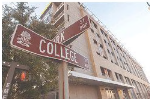
This garage, between the USC campus and the Vista, is among those that can become overwhelmed during large events.

Mayor Steve Benjamin exploring public/private construction, operation of future, current garages