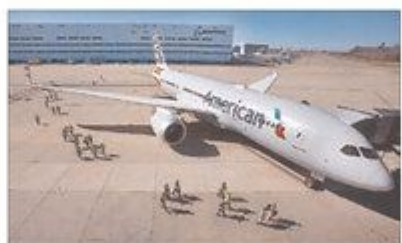
Boeing S.C. workers make their way past the 100th 787 Dreamliner to be delivered from the North Charleston facility earlier this year. Shifts in company strategy and a positive climate in South Carolina helped to cultivate a thriving industry in North Charleston.