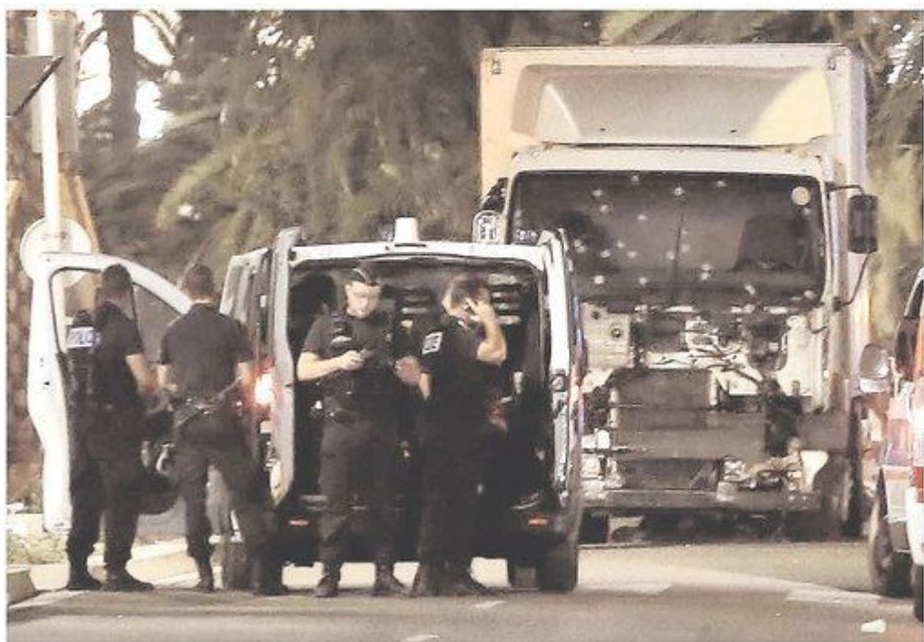
Police officers stand near a van with its windshield riddled with bullets on Thursday on the Promenade des Anglais in Nice, France.