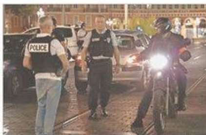
Police officers early Friday seal off the area of an attack after a truck drove onto the sidewalk and plowed through a crowd of revelers who'd gathered to watch the fireworks in the French resort city of Nice in southern France.