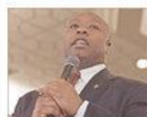
Sen. Tim Scott, R-S.C., delivered his final installment of floor speeches Thursday.