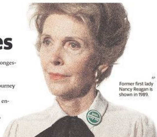
Former first lady Nancy Reagan is shown in 1989.

For the full story, plus reactions and vignettes from those who knew her, go to 9A.