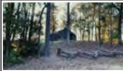
TABLE ROCK STATE PARK...reminds us of our mission. It's sincere, meaningful, measurable and sustainable! It has beautiful waterfalls, a huge mountain facing the sun, cabins, RV & tent campsites and an amazing staff! Oh, it's located in Pickens, SC.

The campfire in our logo represents the portal for amazing conversations. Your race, gender, or age does not matter. We ALL have something to say! #blackfolkscamptoo #adventurebeyond #backpacking #hiking #outdoors #outdoorlife #icamptoo #tentlife #rvlife #campinglife South Carolina State Parks