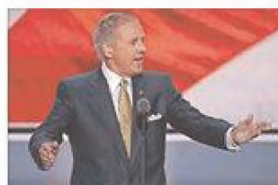
S.C. Lt. Gov. Henry McMaster nominates Donald Trump as the Republican candidate for president Tuesday in Cleveland.