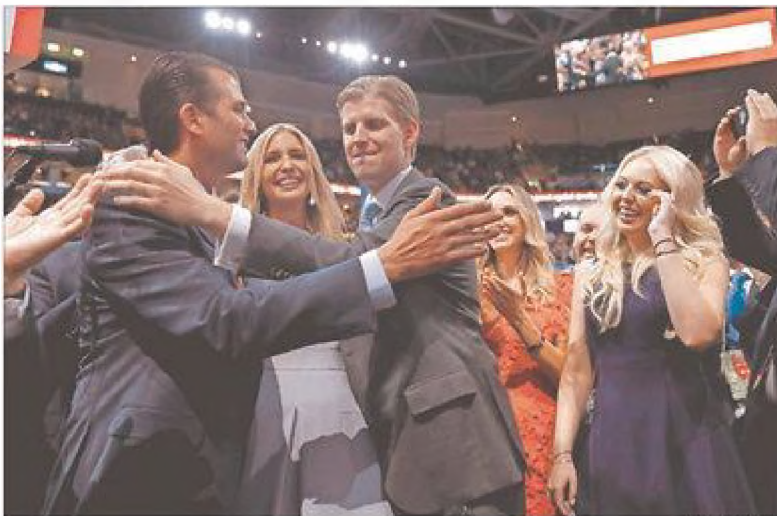
Republican presidential candidate Donald Trump's children (from left) Donald Trump Jr., Ivanka Trump, Eric Trump and Tiffany Trump celebrate Tuesday during the second day of the Republican National Convention in Cleveland.

Trump, Republicans celebrate long, bumpy road to nomination, bash Clinton