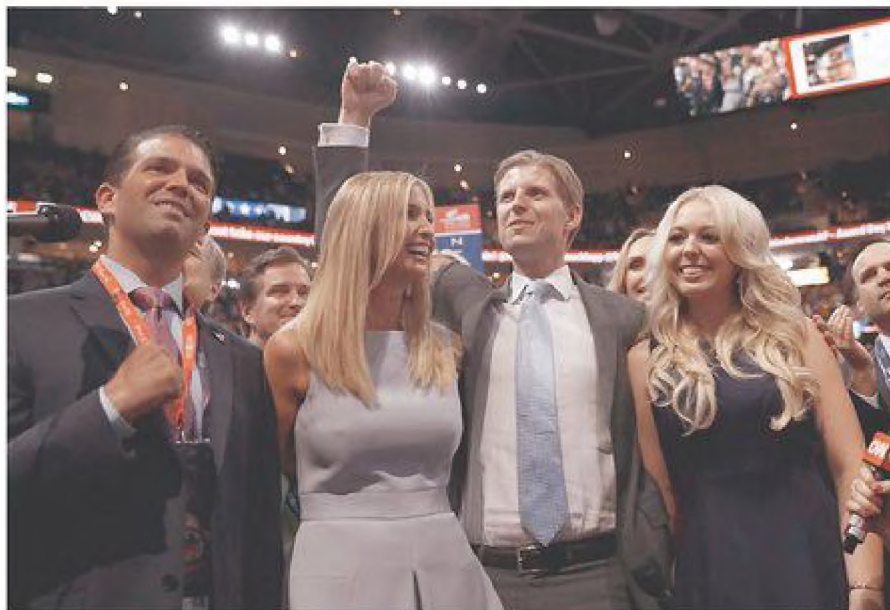
Republican presidential candidate Donald Trump's children — Donald Trump, Jr., Ivanka Trump, Eric Trump and Tiffany Trump — celebrate on the convention floor Tuesday during the second-day session of the Republican National Convention.