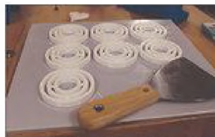
A project waits to be removed from a 3-D printer plate.

A 2006 Honda Accord was traveling head-on toward the pickup truck, and because of another oncoming car, the Accord swerved onto the right side of the road in order to avoid a collision, Collins said. That