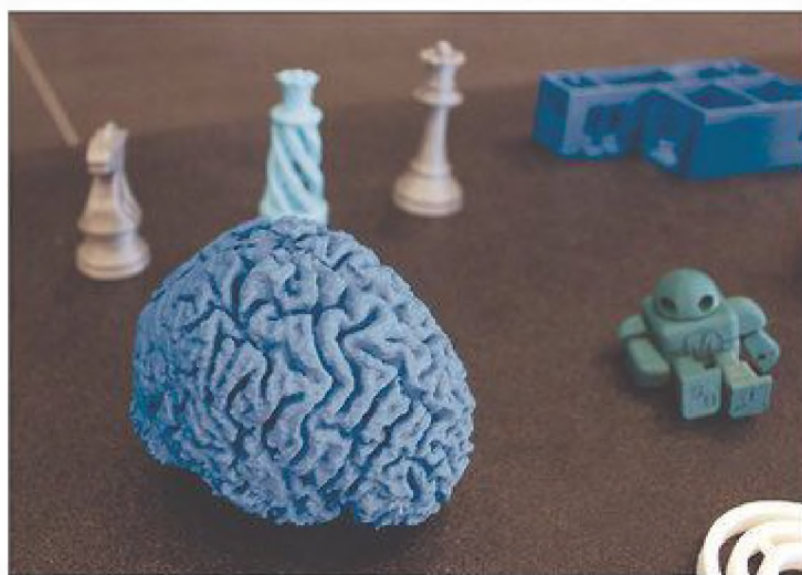
Several of the items on display in the Makerspace include a brain and chess pieces, all with the intricate design of pieces built traditionally.

BY MELISSA ROLLINS Morning News mrollins@florencenews.com