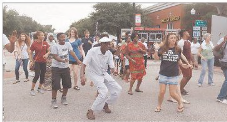
Hartsvillians celebrate in the streets their All-America City status on Friday night.

In celebration of the city of Hartsville's All-America City recognition, a downtown Block Party was held Friday evening with free hot dogs and drinks and T-shirts to the first 100 residents.