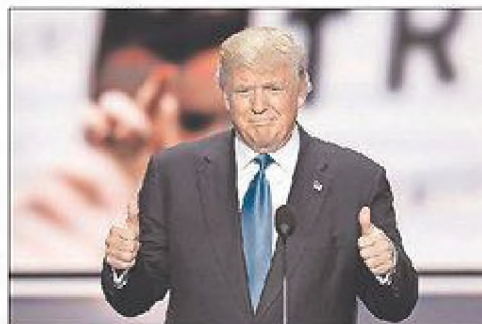
Donald Trump flash two thumbs up Monday during the opening day of the Republican National Convention in Cleveland. On Tuesday, Republicans nominated Trump as their presidential candidate.