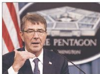
Defense Secretary Ash Carter speaks to reporters Dec. 11 at the Pentagon.

The attack happened as Taliban fighters overran a strategic district in southern Helmand province, the scene of some of the deadliest fighting between the Taliban and international