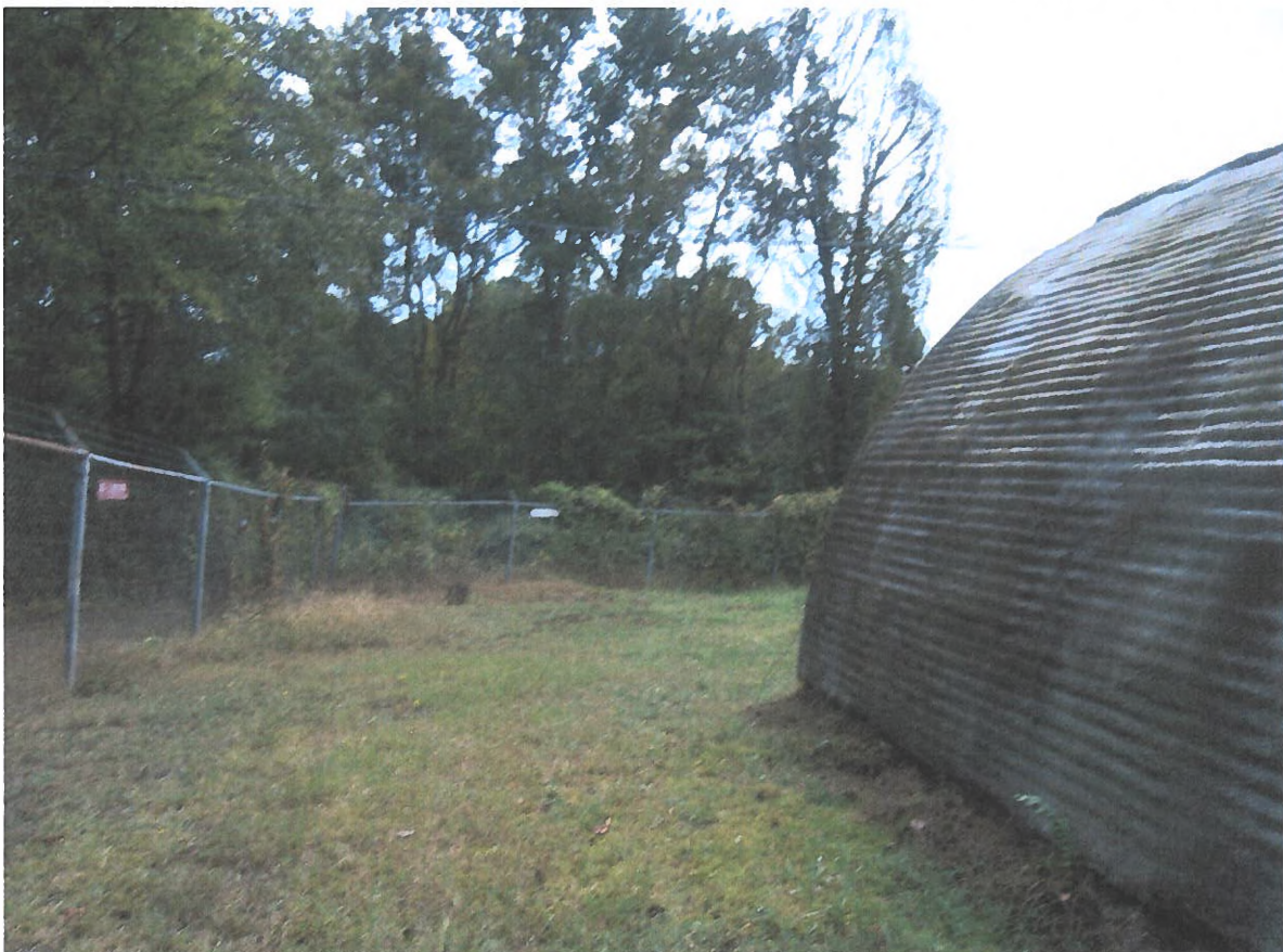
Figure 4: Eastern elevation of the Greenwood Motor Pool Storage Building (SCARNG).