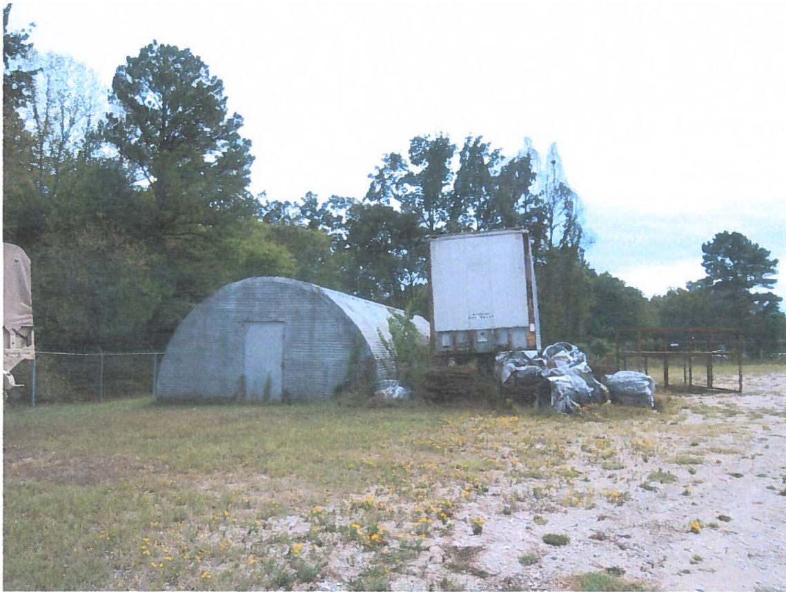
Figure 3: Northern elevation of the Greenwood Motor Pool Storage Building (SCARNG).