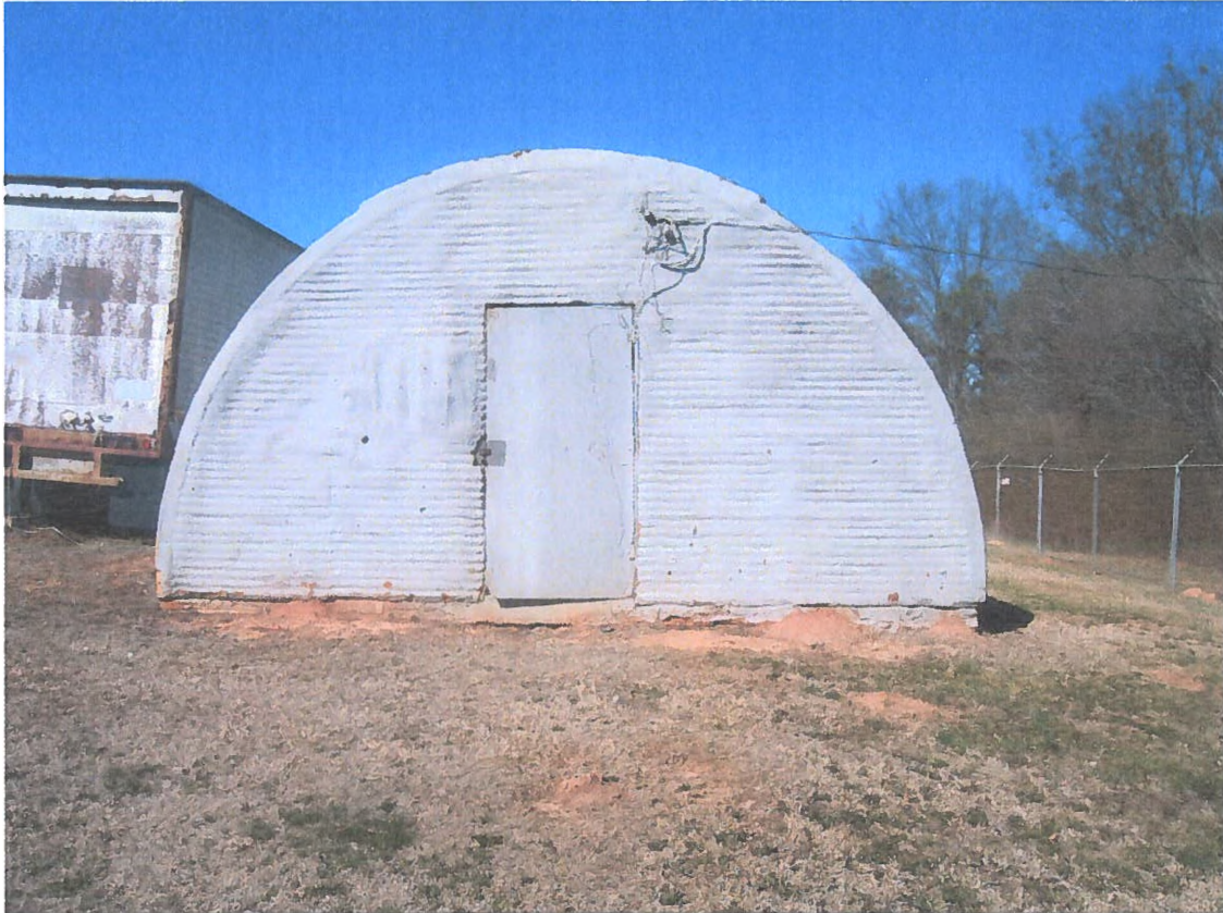
Figure 5: Southern elevation of the Greenwood Motor Pool Storage Building (SCARNG).