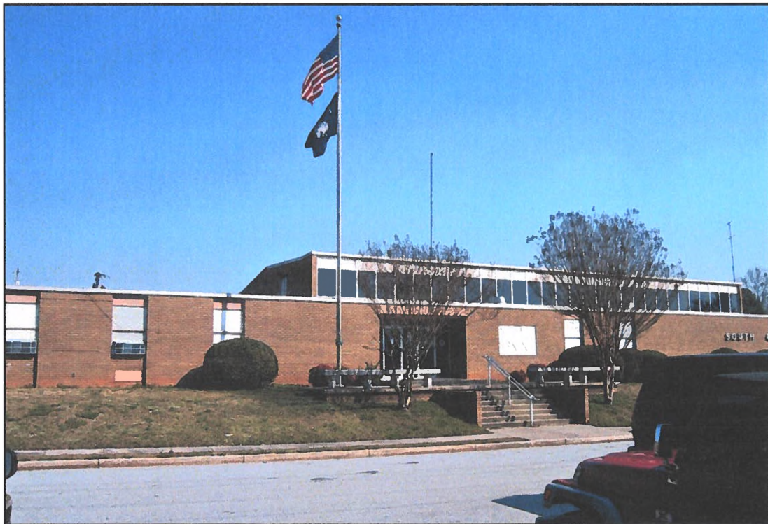
Figure 6: The Greenwood Readiness Center (SCARNG).