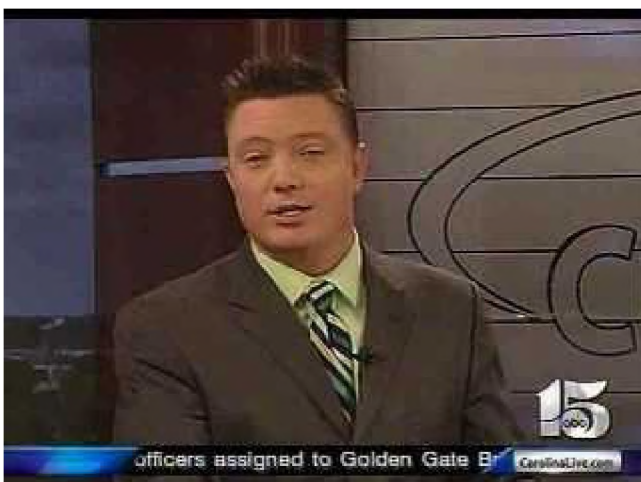
WPDE (ABC)5/8/2013 6:02:30 AM Myrtle Beach, SC Good Morning Carolinas