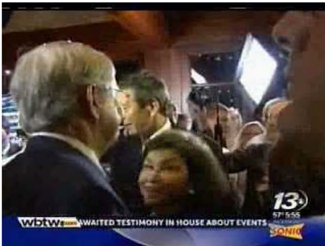
WBTW (CBS)5/8/2013 5:55:11 AM Myrtle Beach, SC News 13 Early Morning

counton2.com. >> imagine a trip to new york city! >> nice. and broadway too. it is now 5:51. coming up on 'news2 today,' weeks after governor nikki haley signed off on with boeing, county council took a vote. we'll tell what you they voted. >>> plus we'll tell you about efforts to strengthen south carolina's ethics