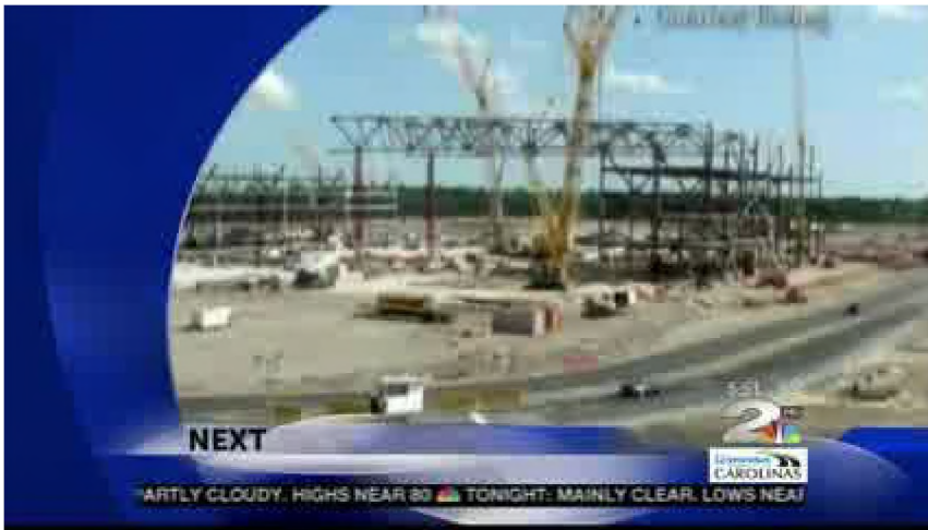
Charleston, SC WCBD 5AM News