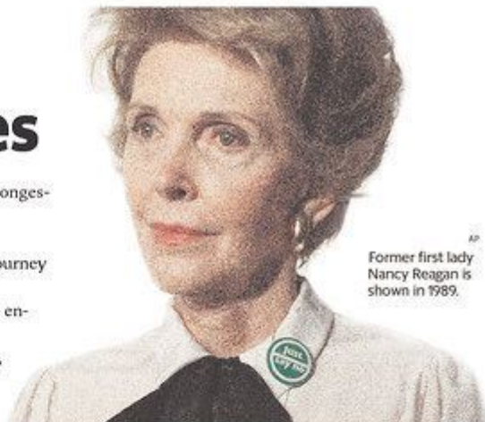
Former first lady Nancy Reagan is shown in 1989.

For the full story, plus reactions and vignettes from those who knew her, go to 9A.