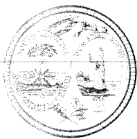
Hugh E. Weathers Commissioner

Wade Hampton Office Building P.O. Box 11280 Columbia, S.C. 29211