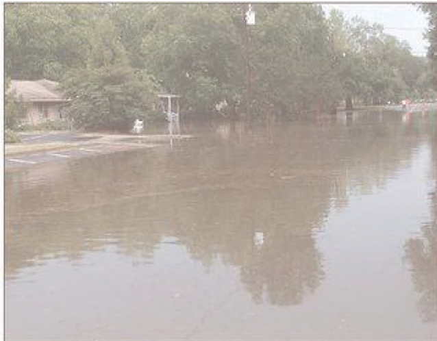
Many residents of Cheraw say they can't remember when so much rain fell so quickly. Flooding areas that don't normally flood.

"A transformer was down in the Reid Park community, and a tree knocked another transformer off the pole on