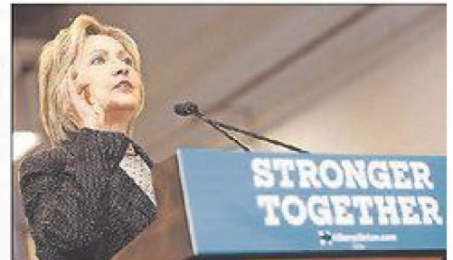
Democratic presidential candidate Hillary Clinton speaks about the economy Tuesday at Fort Hayes Vocational School in Columbus, Ohio.

The speech was similar to one earlier this month in San Diego in which Clinton tried to undercut the Republican candidate's foreign policy credentials. This time, at an