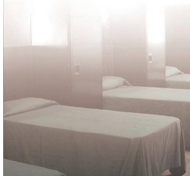
Thirty new beds accompanied by lockers create a home base at Greenwood Pathway House for homeless men as they get back on their feet.