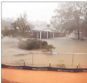
Complete neighborhoods were flooded as more than 20 inches of rain fell in a three-day period.