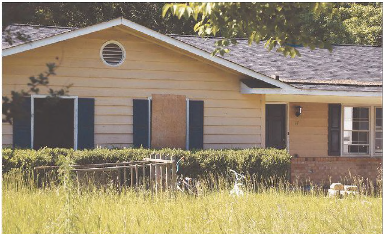
NOTHING(DAMAGE) LEFT SUMTER ITEM

Not all homeowners have been able to recover from October's floods. Work continues at many homes such as the one above.