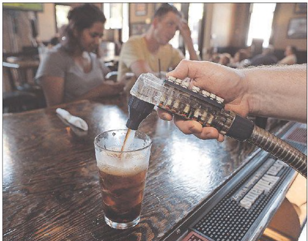
A worker at Wild Ace Pizza and Pub fills a glass with soda. Local officials don't expect a soda tax, like one passed in Philadelphia, to be a revenue stream for early childhood education programs.