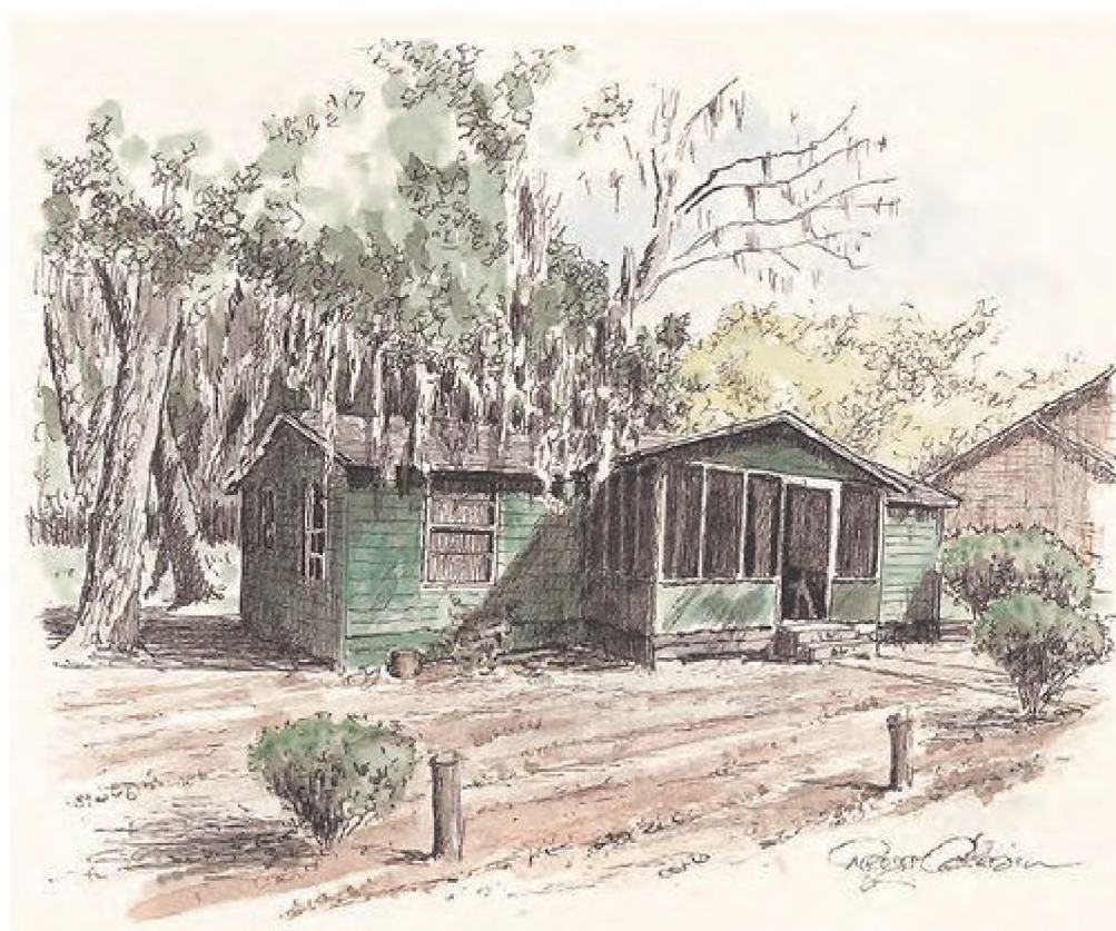
Little Green House on DuBois Lane in Bluffton.

Boating and touring company May River Excursions opens a store at the corner of Bridge and Calhoun streets. 9B