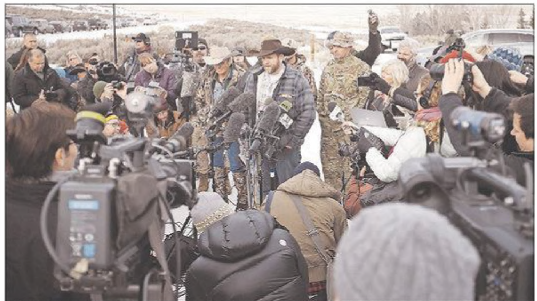
Ammon Bundy, center, one of the sons of Nevada rancher Cliven Bundy, speaks with reporters Monday during a news conference at Malheur National Wildlife Refuge headquarters near Burns, Ore.