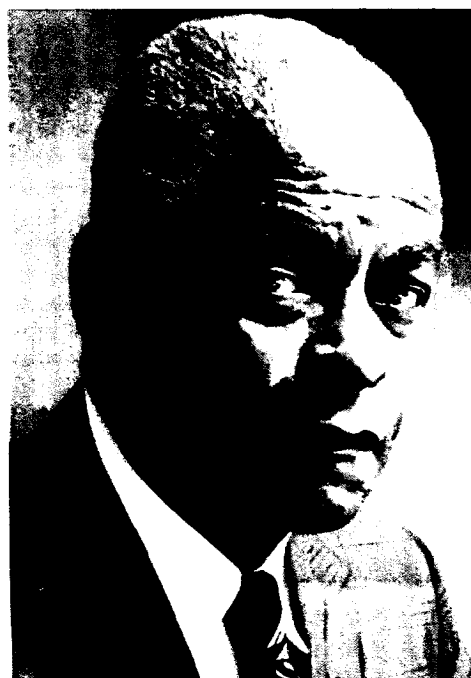
Dr. Benjamin Elijah Mays