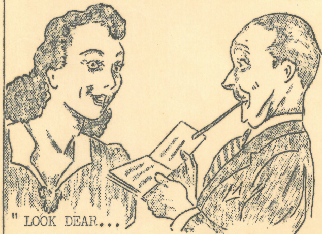
A Typical Gonzales Gardens Scene...

Your interest and contributions within the next few days will determine how often THE GONZETTE will be issued.