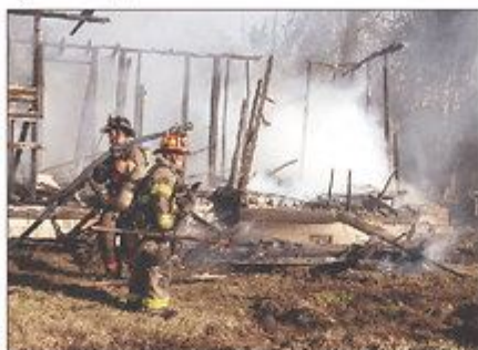
Firefighters were unable to save this house on Holloway Lane in West Florence Tuesday afternoon.