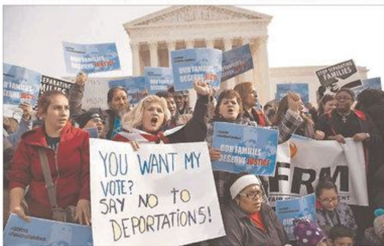
Immigration supporters from CASA de Maryland, an advocacy group, rally outside the Supreme Court last Friday in Washington.

Outcome could bring relief, hardships to Lowcountry, S.C. families