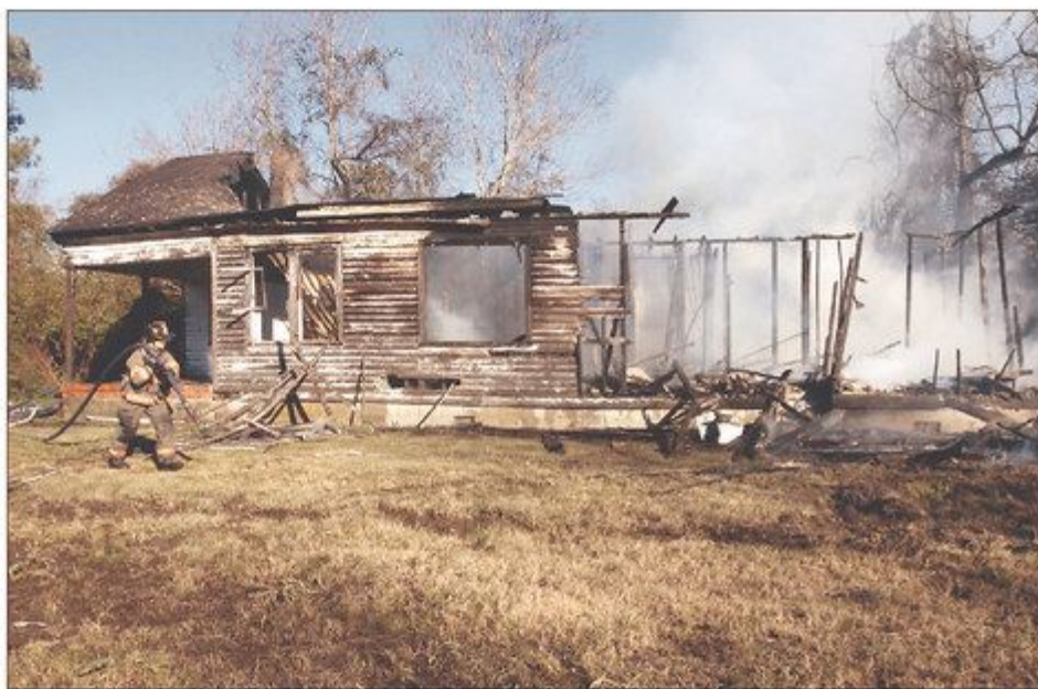
A house on Holloway Lane in West Florence was destroyed by a fire Tuesday afternoon. No one was in the home at the time of the fire and no injuries were reported.

As natural gas prices fall and "regulatory actions" hit the central Appalachian coal field, the com-