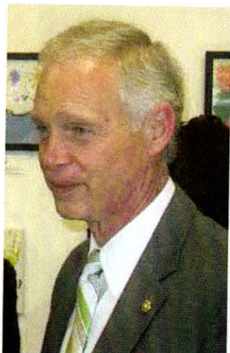
Sen. Ron Johnson (R-Wisc.). Johnson painted a canvas of teddy bears.