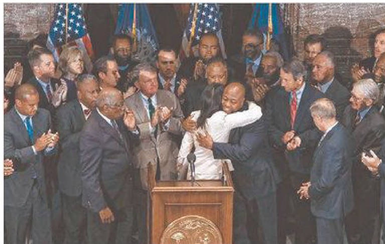
South Carolina Gov. Nikki Haley embraces U.S. Sen. Tim Scott during a news conference in the South Carolina Statehouse on Monday in Columbia. Haley said the Confederate flag should be moved from the grounds of the state Capitol, taking her position on the divisive symbol amid growing calls for it to be removed.

State's 2 U.S. senators join push in wake of Charleston massacre