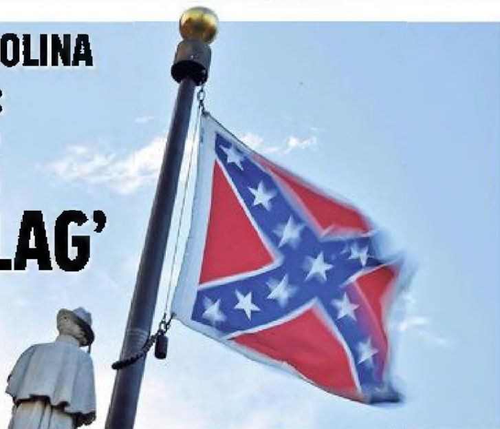
The Confederate flag flies next to a monument to victims of the Civil War in Columbia, S.C., on Saturday.

Obama uses 'N' word to make a point on race relations Walmart to stop selling Confederate flag items Rem Rieder: Not 'too soon' to talk gun control