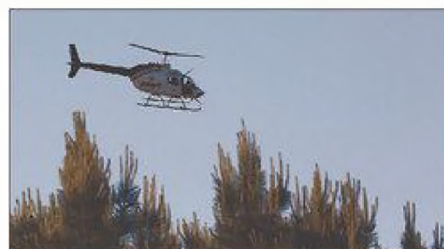
The Florence County Sheriff Office's Raptor 1 seen here flying in late April 2015, is one of two helicopters owned by the FCSO.