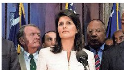
South Carolina Gov. Nikki Haley called for state legislators to address removing the Confederate flag from the capitol.

Carolina has a tough history," Haley said. "We don't need reminders."