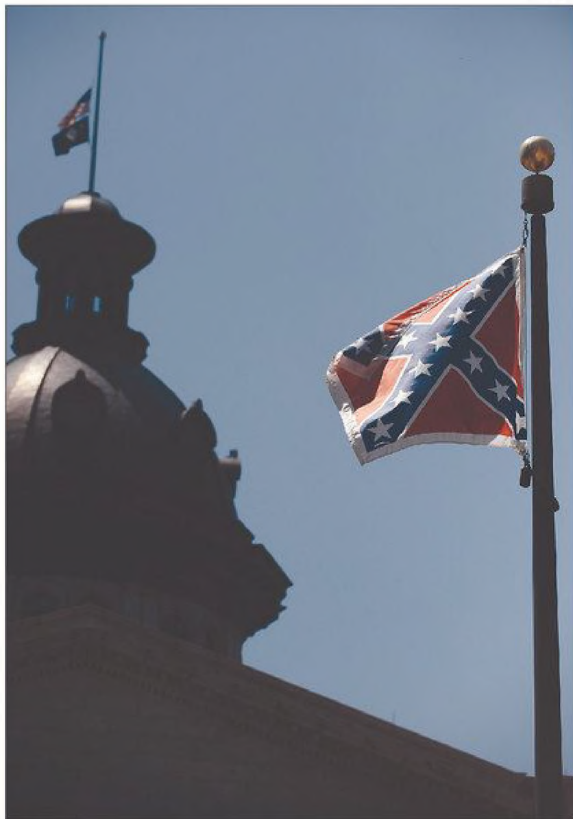
The Confederate flag flies near the South Carolina Statehouse on Friday in Columbia.