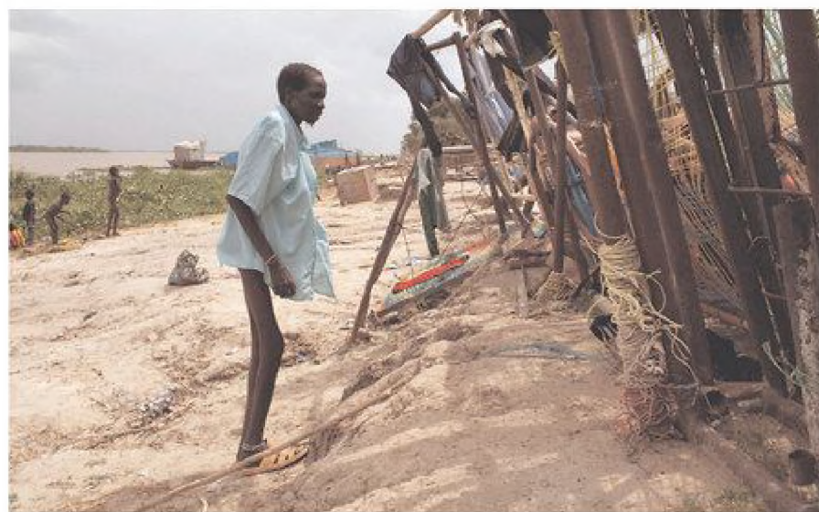
For more than a month, no aid could reach Wau Skulluk, a South Sudanese village on the Nile, because of the fighting.