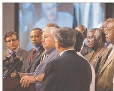
North Charleston Mayor Keith Summy calls for removal of the Confederate flag from the Statehouse grounds during a press conference in North Charleston on Monday.