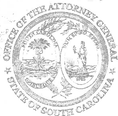
ALAN WILSON ATTORNEY GENERAL