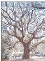
It's Arbor Day: Why South Carolina loves its live oaks Local & State, B2

One Pearl Harbor survivor's quest to identify fallen soldiers Nation, A8