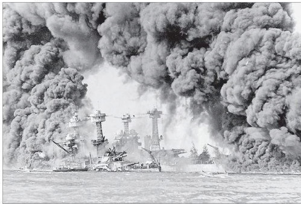
Pictured are the battleships West Virginia and Tennessee burning after the Dec. 7, 1941, Japanese attack on Pearl Harbor.