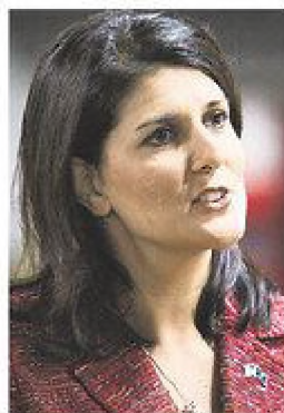
Gov. Nikki Haley said she would not nominate herself to fill Sen. Jim DeMint's seat.