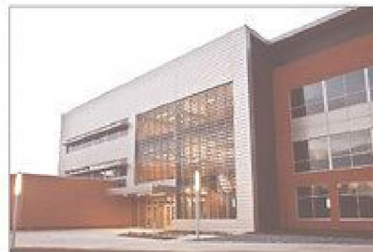
South Carolina State University is developing an 87,000-square-foot engineering and computer science complex.