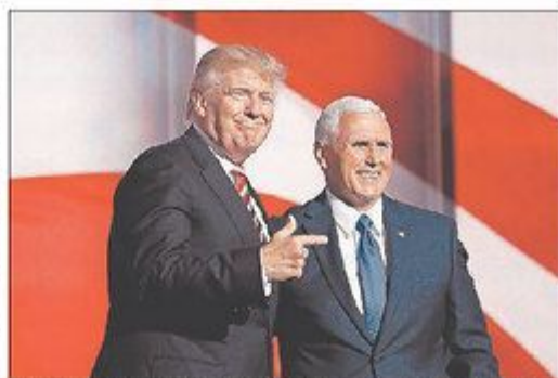
Republican presidential candidate Donald Trump greets vice presidential nominee Gov. Mike Pence of Indiana at the Republican National Convention in Cleveland on Wednesday night.

"Vote for candidates up and down the ticket who you trust to defend our freedom and to be faithful to the Constitution," Cruz said. While he backed some of Trump's policy proposals, including building a wall along the