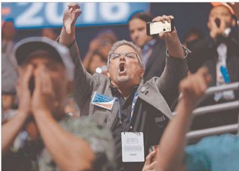
People react negatively to Sen. Ted Cruz, R-Tex., as Cruz addresses the delegates during the third day of the GOP Convention.

Senator's defiance underlines split in GOP, overshadowing Pence