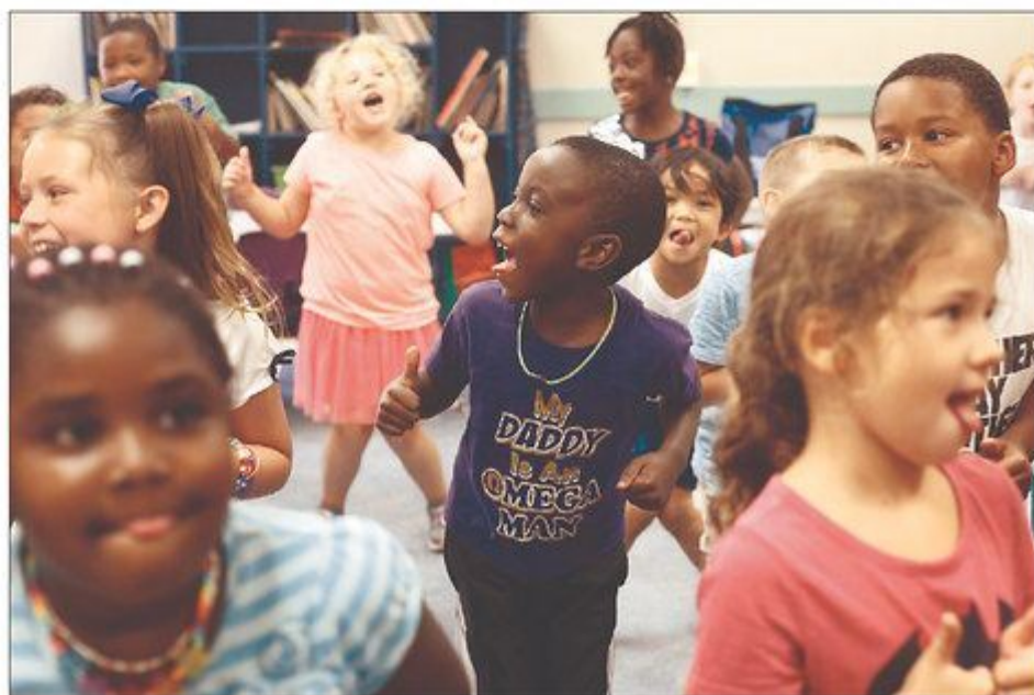
Campers sing and dance during summer day camp at the Florence Family YMCA on Wednesday.